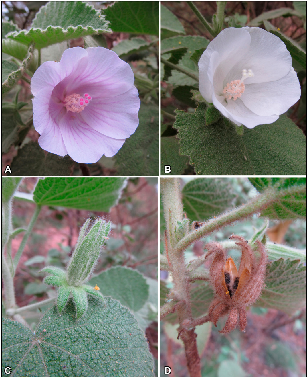
Figure 1. Hibiscus campanulatus. A – flowering plant in situ showing an axillary, pale pink flower with campanulate corolla; B – flowering plant in situ with a white, campanulate flower; C – flower in bud showing distinct calyx with shorter, recurved epicalyx lobes; D – fruit dehisced with some mature black-coloured seeds.