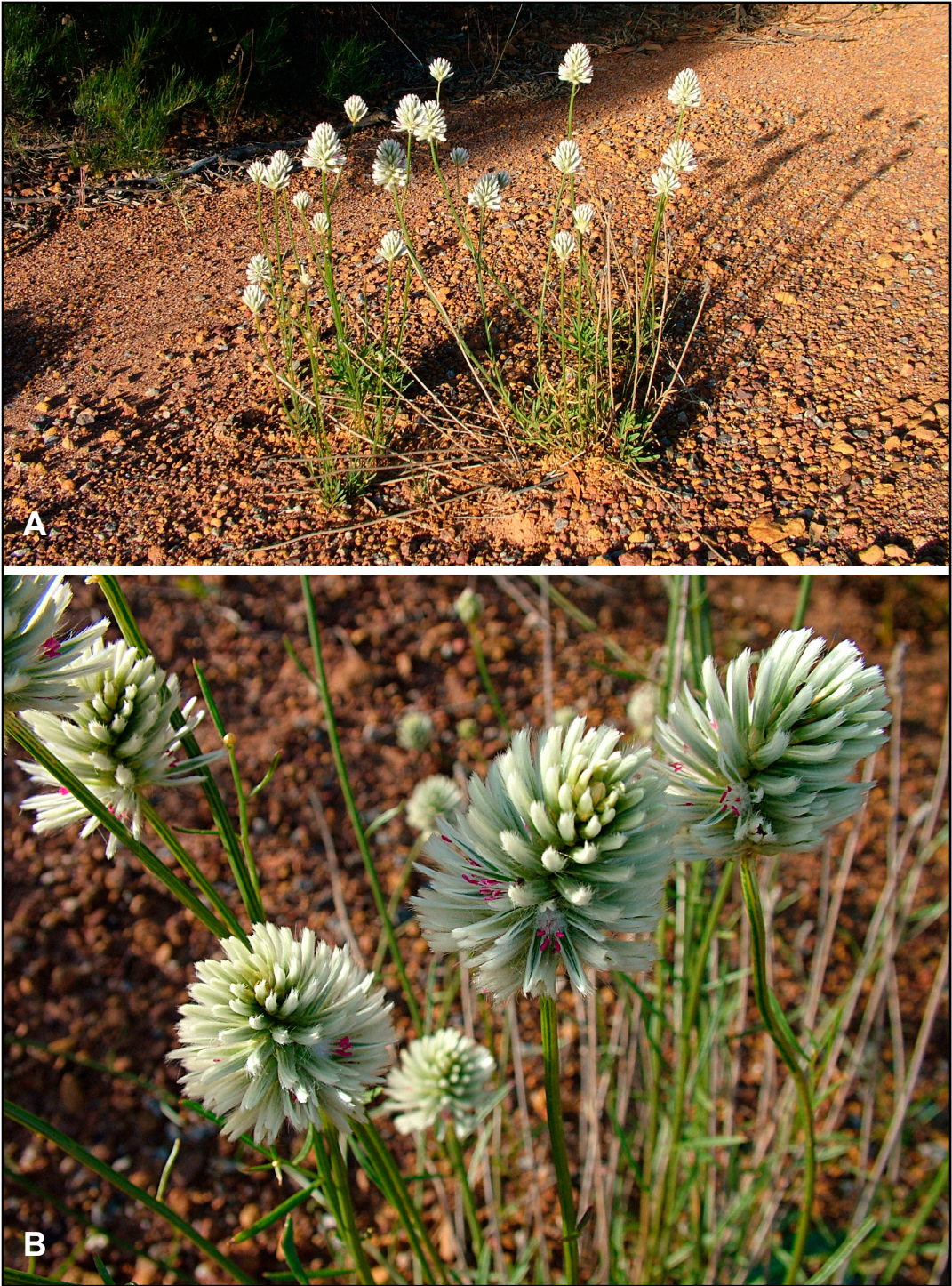
Figure 1. Ptilotus benlii . A – flowering plant in situ showing the erect habit and green-white flowers; B – flower, showing the characteristic pink filaments and anthers. Images from R. Davis 10952.