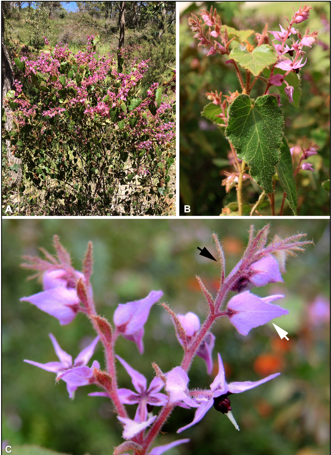
Figure 1. Lasiopetalum bracteatum . A – habit; B – ovate leaves with a scarcely cordate base and scattered stellate hairs on the adaxial surface; C – a loose dichasial inflorescence covered in stellate hairs and red-tipped glandular hairs with narrowly elliptic bracts (black arrow) and ovate, petaloid epicalyx bracts (white arrow) positioned some distance from the base of the pink flowers. Unvouchered specimens from near Lesmurdie Falls, Lesmurdie.