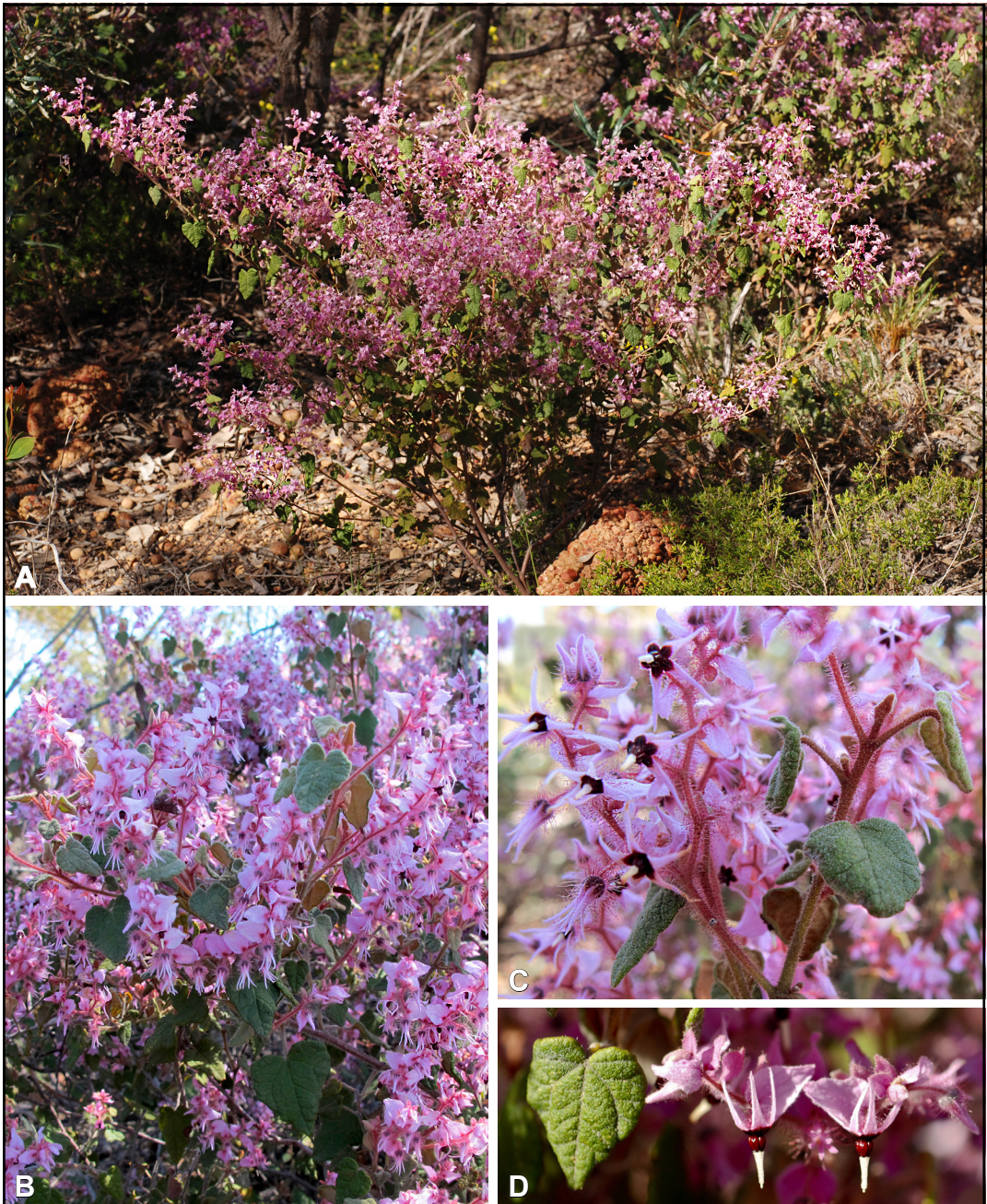
Figure 3. Lasiopetalum decoratum . A – habit; B – shrub showing masses of pink flowers with large, petaloid epicalyx bracts and discoloured leaves; C – loose dichasial inflorescences of pink flowers with a deep red base and dense glands on each peduncle, pedicel and outer calyx; D – broadly ovate, rugose, thick and stiff leaves with a slightly cordate base and pink flowers with narrow calyx lobes. Voucher: F. Hort 2926. Images: F. & J. Hort.

flowers with narrower calyx lobes (1.3–2.1 mm wide vs 2–2.6 mm) and a mauvish pink calyx with a dark red base only, as opposed to a pink calyx with the base and the centre of each lobe being dark red to red.