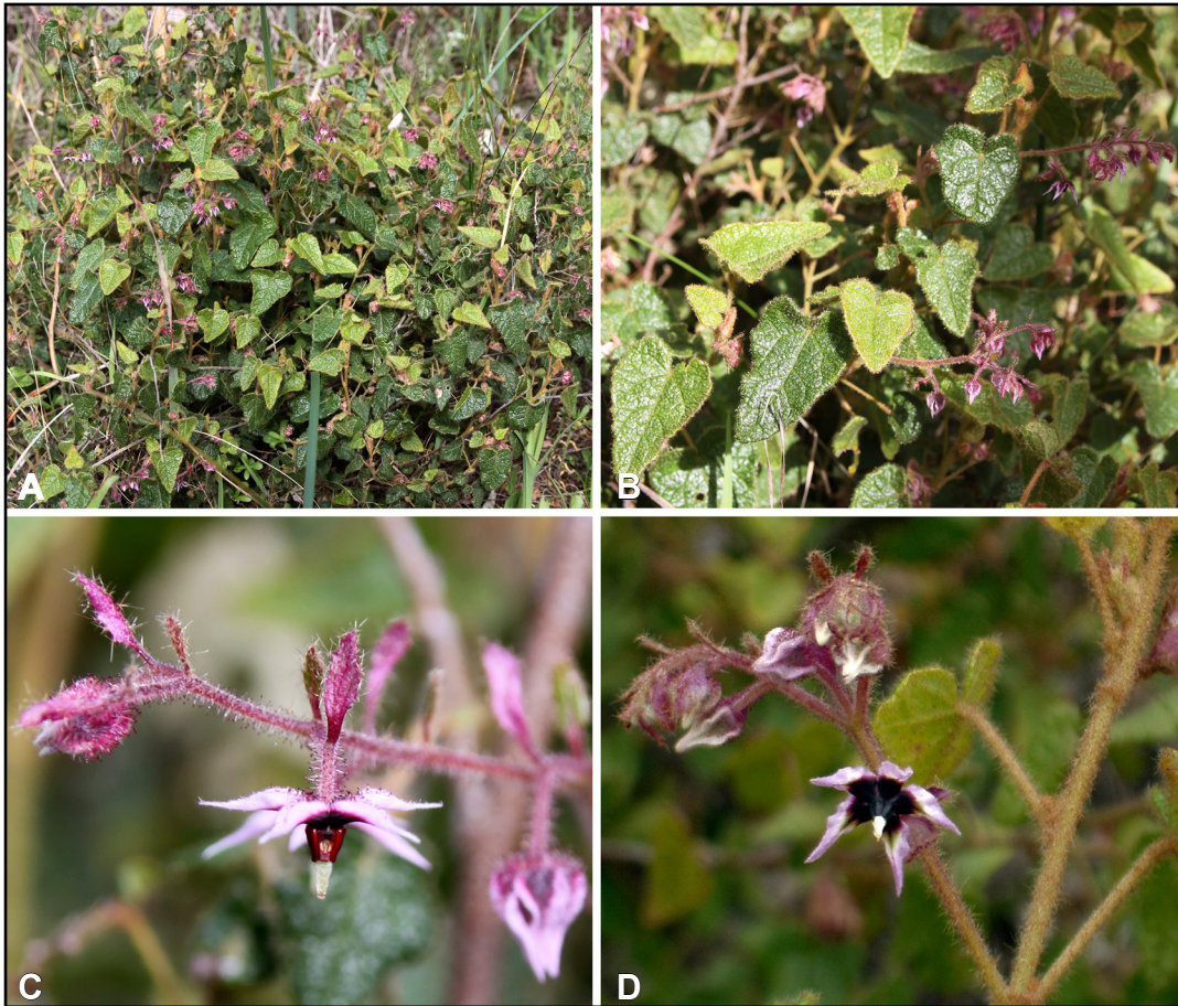
Figure 4. Lasiopetalum membranaceum . A – habit; B – ovate, slightly to moderately cordate leaves with a scarcely rugose surface; C – flower showing the narrowly elliptic, petaloid epicalyx bracts towards the base of each pedicel and splayed calyx lobes with short glandular hairs; D – pink flower showing the deep red colour at the base extending upwards towards the centre of each lobe (sometimes grading to green). Unvouchered specimens from Kings Park.

Selected specimens examined. WESTERNAUSTRALIA: [localities withheld for conservation reasons] 24 Oct. 1998, B. Bischoff BNC 829 (PERTH); 4 Dec. 1971, M.L. Cambridge s.n. (PERTH 02704587); 7 Jan. 2009, B. Fellows & J. Waud BCF 82 (K, PERTH); 23 Nov. 1998, S.A. Fisher 315 (PERTH); 19 Mar. 2001, A. Horan s.n. (PERTH 05767563); 19 Oct. 1995, B.J. Keighery 2440 (PERTH); 4 Nov. 1987, G.J. Keighery & J.J. Alford 1604 (PERTH); 5 Dec. 1992, G.J. Keighery 12740 (PERTH); 10 Nov. 1969, V. Mann & A.S. George 42 (PERTH); 14 Feb. 2001, G.S. McCutcheon GSM 3020 (PERTH); 1 Nov. 2005, Wildflower Society of W.A. Paganoni PAG OP/36 (PERTH); 20 Oct. 1972, S. Paust 1366 A (CANB, PERTH); 6 Nov. 2003, C. Smith s.n. (PERTH 06586384); 23 Oct. 1994, C. Tauss s.n. (PERTH 03980820); Nov. 1920, E.H. Wilson & D.A. Herbert s.n. (PERTH 01046101); 8 Dec. 1993, C.F. Wilkins & K.A. Shepherd CW 622 (PERTH); 18 Jan. 1994, C.F. Wilkins & K.A. Shepherd CW 630 (PERTH); 24 Apr. 1994, C.F. & J. Wilkins CW 673 (PERTH); 28 Sep. 2003, C.F., J.A., S.A. Wilkins & S. Blake CW 1778 (PERTH).