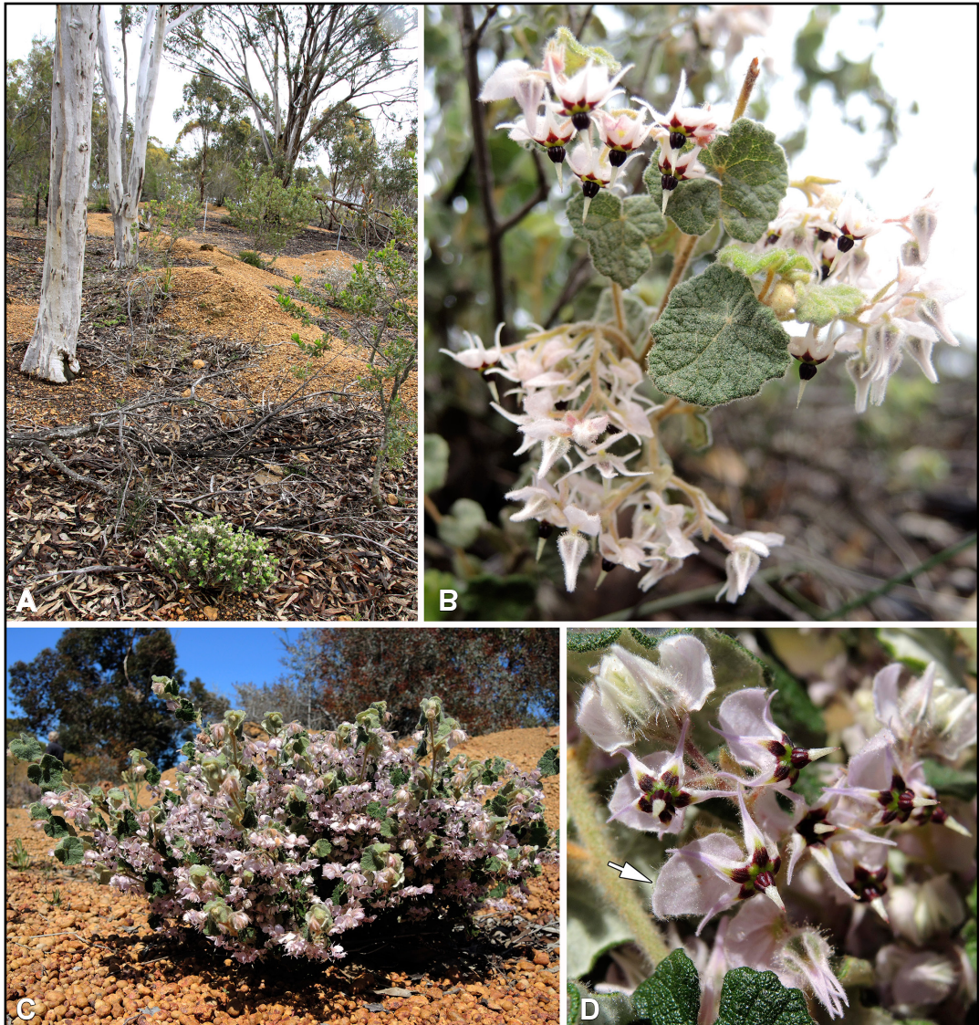
Figure 6. Lasiopetalum rotundifolium . A – habitat; B – habit; C – orbicular, stiff and discolorous leaves with a deeply cordate base and rounded apex; D – dichasial inflorescence of flowers covered in stellate and glandular hairs, with broadly ovate, pale pink, petaloid epicalyx bracts (white arrow), and pale pink calyx lobes that are green at the base and centre of each lobe with a dark red patch in the middle. Vouchers: K.A. Shepherd, S. Willis, F. Walmsley & C. Shepherd KS 1629 (A, C) and K.A. Shepherd & C.F. Wilkins KS 1619 (B, D). Images: K.A. Shepherd.

& C.F. Wilkins KS 1619 (PERTH); 8 Oct. 2016, K.A. Shepherd, S.R. Willis, F. Walmsley & C. Shepherd KS 1629 (CANB, MEL, PERTH); 9 Oct. 2004, C.F. Wilkins & J.A. Wilkins CW 1962 (MEL, PERTH).