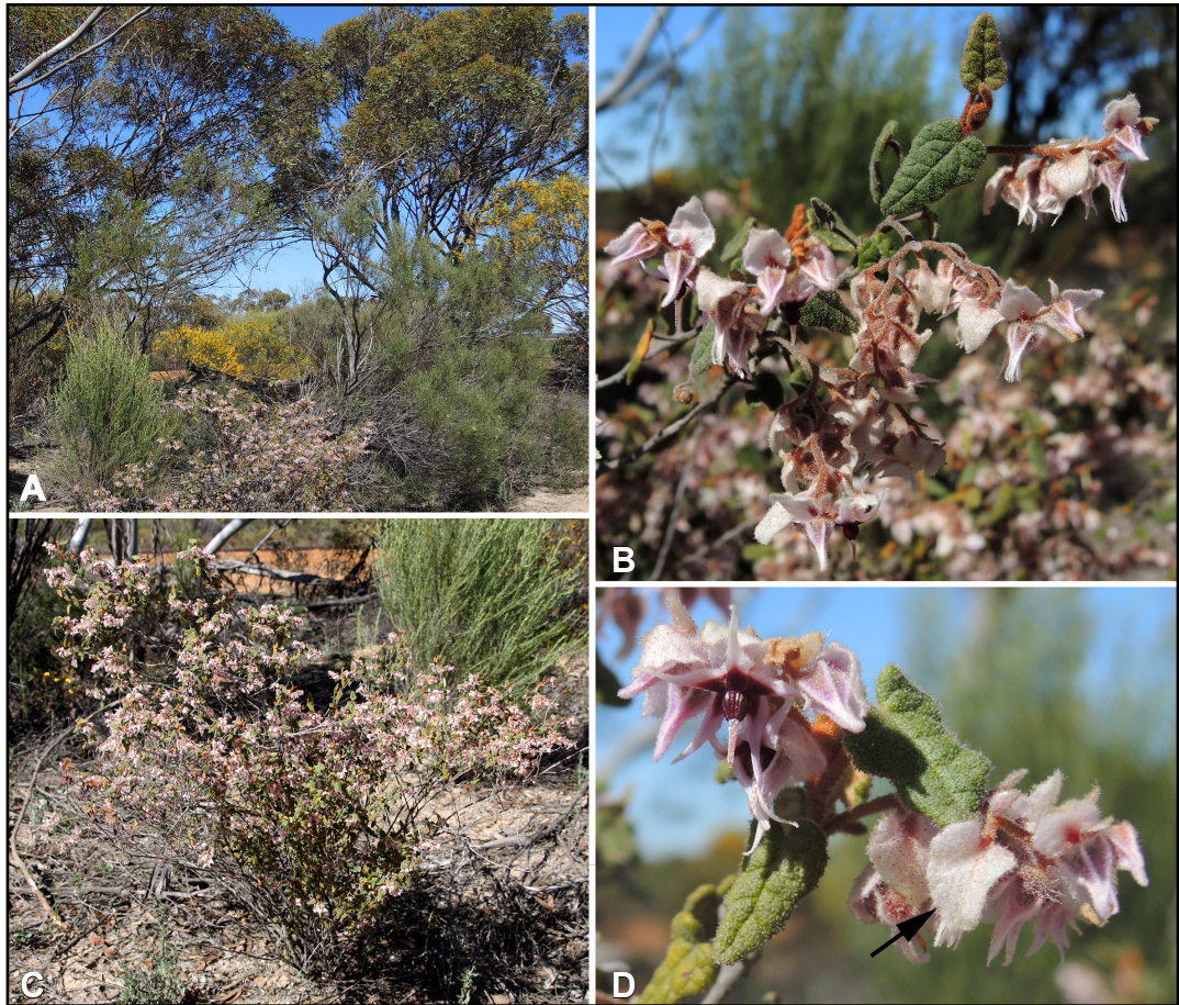
Figure 5. Lasiopetalum molle . A – habitat; B – habit; C – dichasial inflorescence and narrowly ovate, thick and stiff leaves with a slightly to moderately cordate base and slightly rugose surface with scattered residual hair stalks; D – pale pink flowers covered in stellate and glandular hairs with broadly ovate, pale pink, petaloid epicalyx bracts (black arrow) and pale pink calyx lobes with a deep red base and centre. Voucher: K.A. Shepherd & C.F. Wilkins KS 1612. Images: K.A. Shepherd.

open mallee woodland with scrub or heath, often on breakaways of lateritic ridges or in creek beds, in yellow, yellow to red-brown, grey or white sandy clay or sand, mainly with lateritic gravel over granite.