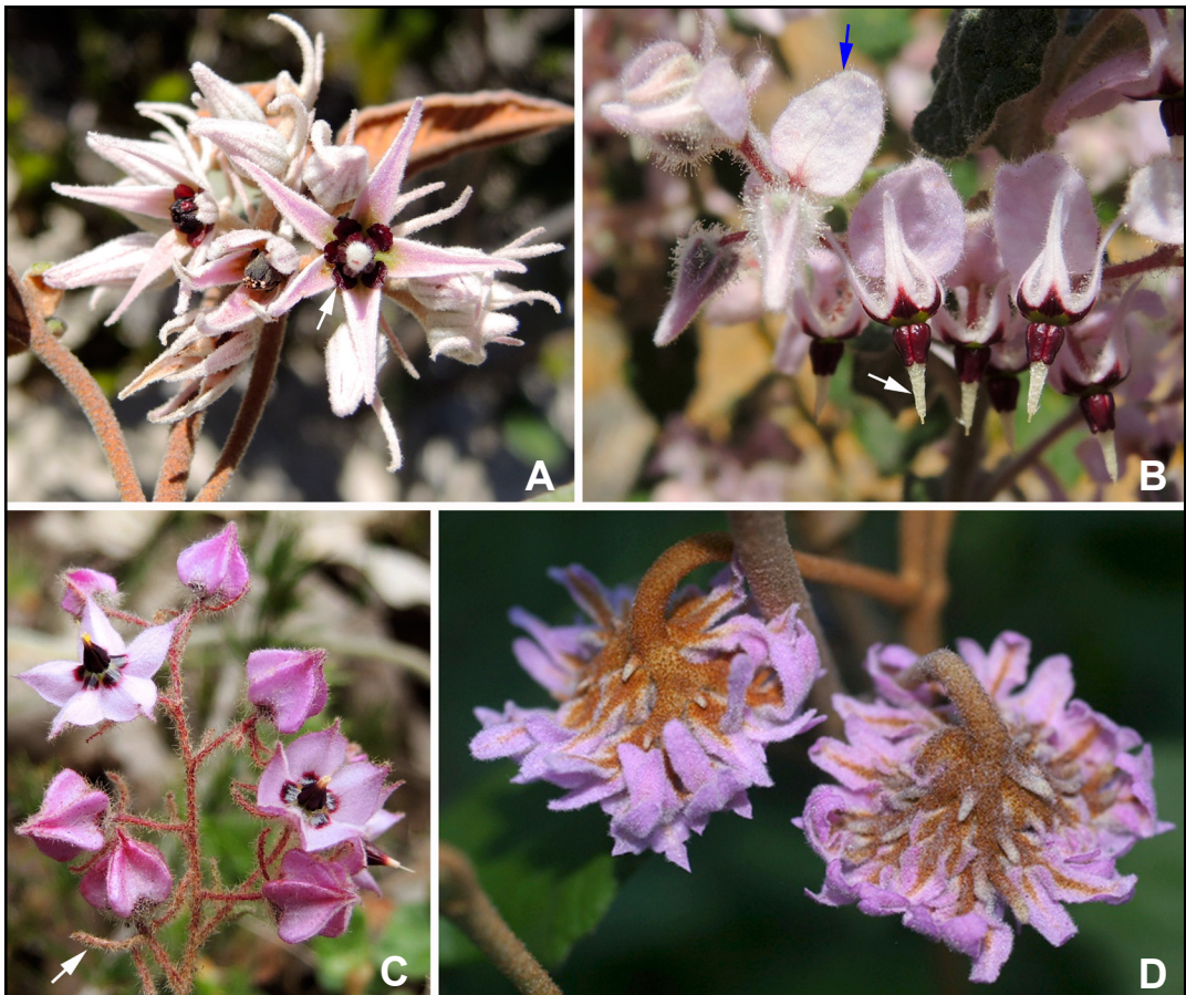
Figure 2. Informative floral characters in Lasiopetalum . A – reduced, scale-like petals (white arrow); B – style with a dense, conical mass of hairs (white arrow); epicalyx bract petaloid and broadly ovate (blue arrow); C – epicalyx bracts linear near the base of the calyx lobe (white arrow); D – epicalyx bracts fused to the base of each flower. Vouchers: L. drummondii Benth. (K.A. Shepherd & C.F. Wilkins KS 1605) (A); L. rotundifolium Paust (K.A. Shepherd & C.F. Wilkins KS 1619) (B); L. glutinosum subsp. latifolium (Benth.) K.A. Sheph. & C.F. Wilkins (K.A. Shepherd & S.R. Willis KS 1565) (C); L. discolor Hook. (R. Cumming s.n.). Images by K.A. Shepherd (A–C) and R. Cumming (D).

Other distinctive floral characters include the presence of: reduced or scale-like petals (steps 2 and 11) that may be glabrous (Figure 1I; 2A) or covered in stellate hairs (Figure 1J); epicalyx bracts (step 4) that are large and petaloid (Figure 2B; also see Shepherd & Wilkins 2018) or linear to narrowly oblong