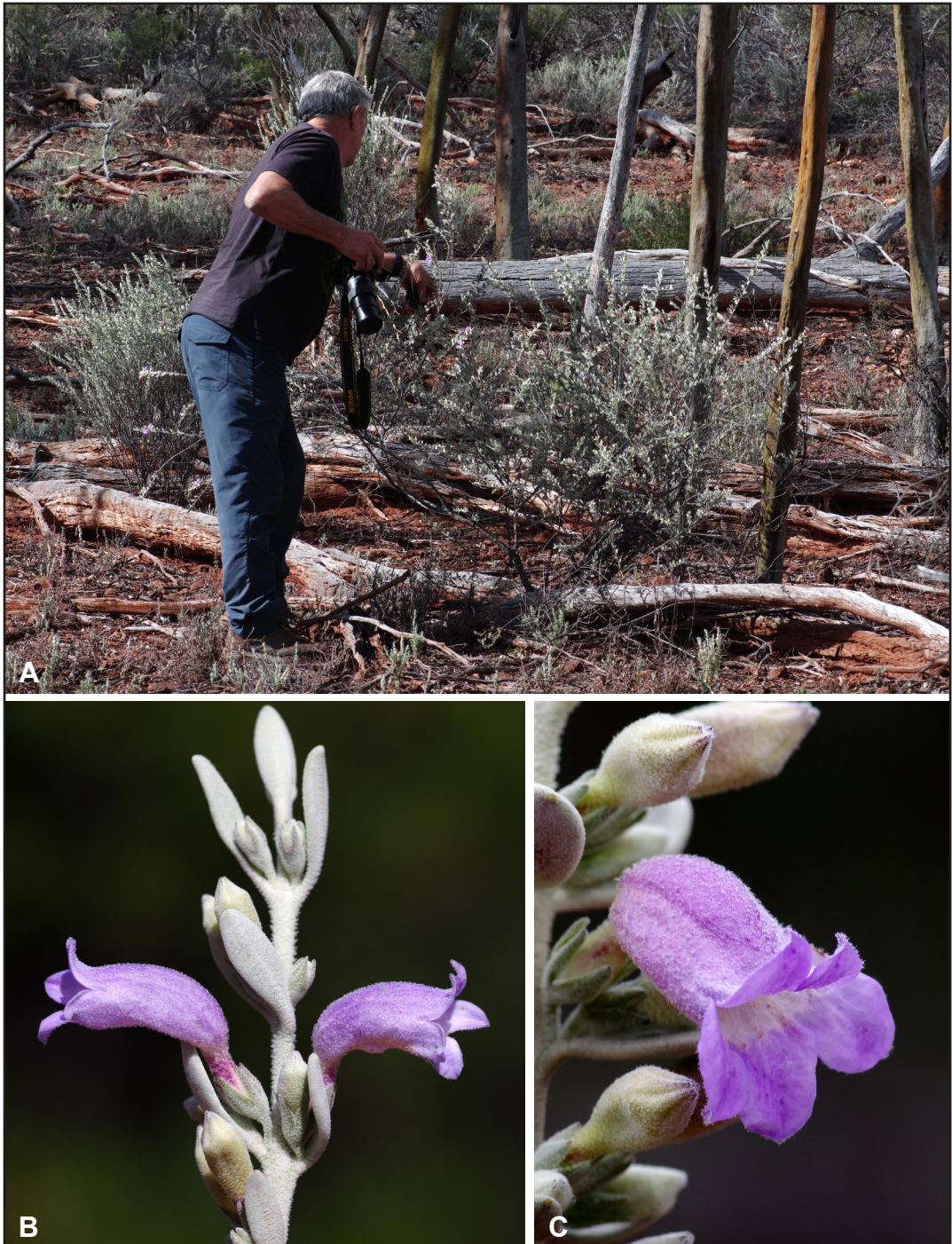
Figure 2. Eremophila sericea . A – flowering plant in situ showing the much branched habit; B – flowering stem, showing the grey-white indumentum on the stems, leaves and sepals, the opposite leaves and the purple to pale lilac, unspotted corolla; C – close up of flower. Images from A.P. Brown & R.W. Davis APB 4308.