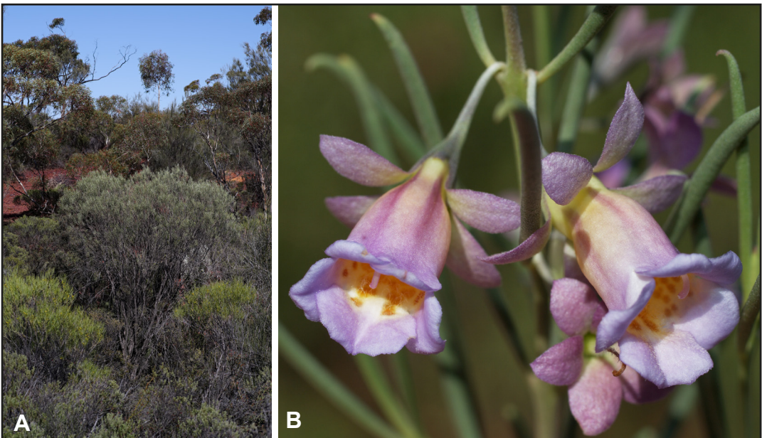
Figure 3. Eremophila xantholaema . A – plant in situ showing the erect habit; B – leaves and flowers showing the terete or sub-terete grey-green leaves and flowers with sub-equal sepals and glabrous corolla with markings in the throat. Images from R.W. Davis & A.P. Brown RD 12904 (A) and V. Clarke & A. Brown VTC 590 (B).

Distribution and habitat. Found near Bulong in the Coolgardie Bioregion ( sensu Department of the Environment 2017), growing in stony, brown loam soils in Eucalyptus-Casuarina woodland on the upper slopes of low rocky hills. Associated species include Casuarina pauper , Eremophila glabra subsp. glabra , E. parvifolia subsp. auricampa , E. pustulata , Senna artemisioides subsp. filifolia and Westringia rigida .