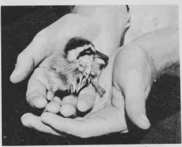
Pink-eared duckling-five days old.

More success was experienced with the third clutch; these were fed on daphnia collected from the metropolitan lakes, and survived for about 10 days. Despite these setbacks the research staff now feel that the initial problems have been overcome and expect greater success in 1973.