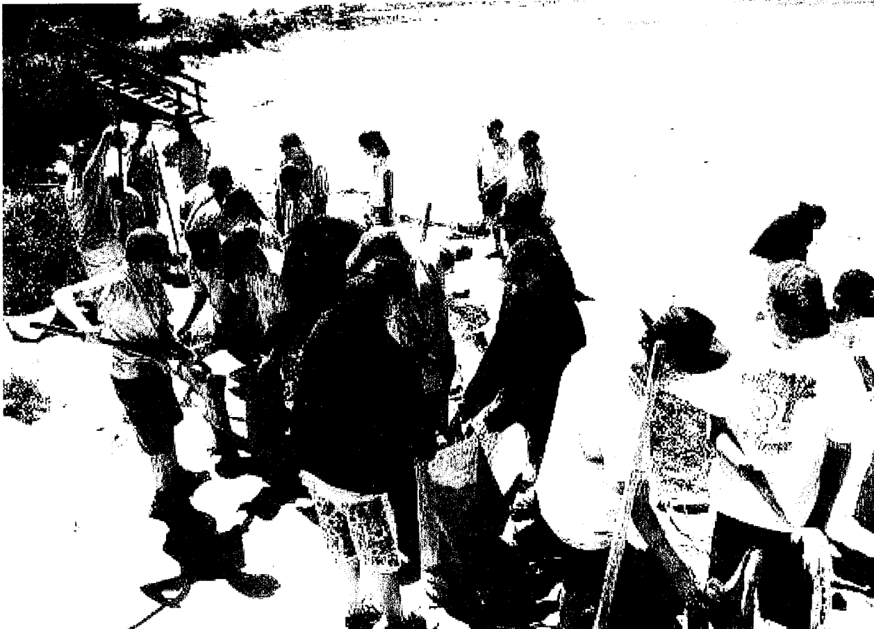
Rossmoyne Senior High School Unit at Penguin Island.