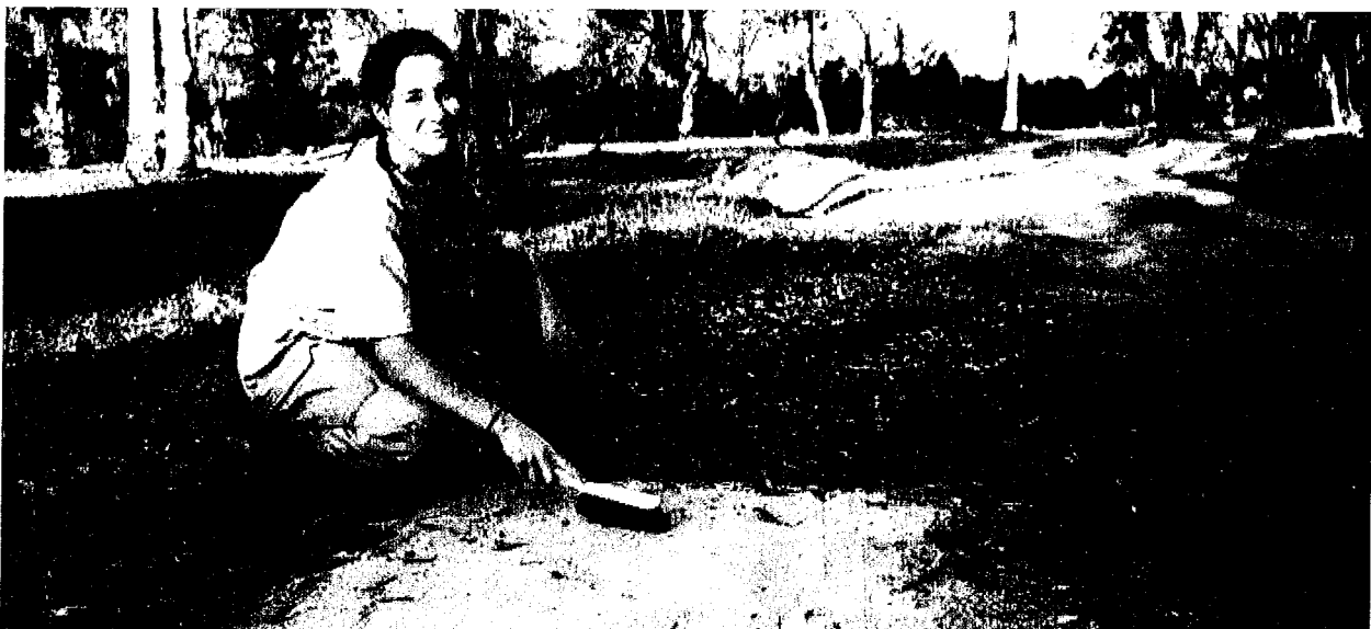
The Perup Reward Experience is held each spring and autumn.

CALM is a host organisation within the Cadets WA program and offers the CALM Bush Rangers program to secondary students across Western Australia. It provides direction and realisation to the future of conservation by instilling a conservation ethic in its cadets. It also provides nationally-accredited credentials and the opportunity to develop life skills by: