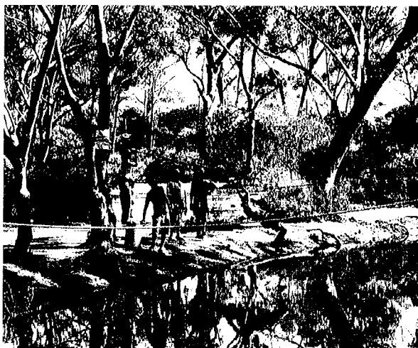
Wongutha (CAPS) Unit camp.