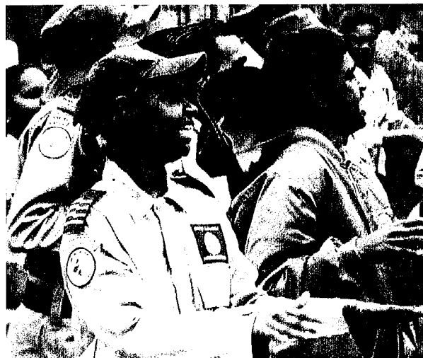
Wongutha (CAPS) Unit at Bromus Dam Camp.