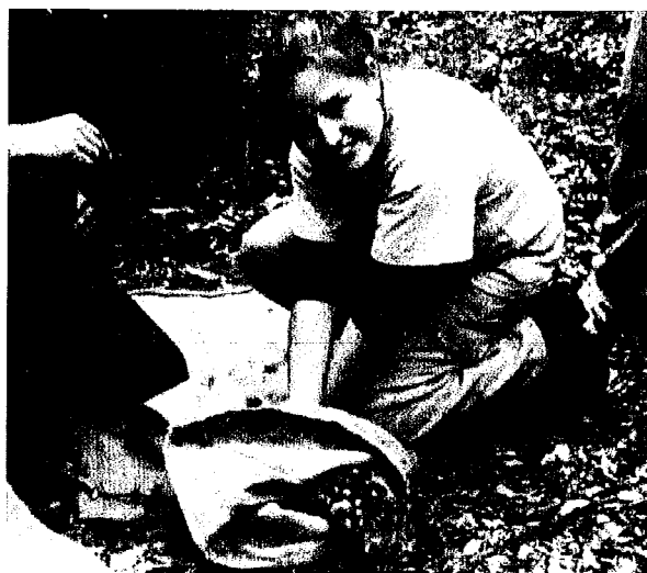
The Perup Reward Camp with CALM's Science Division.