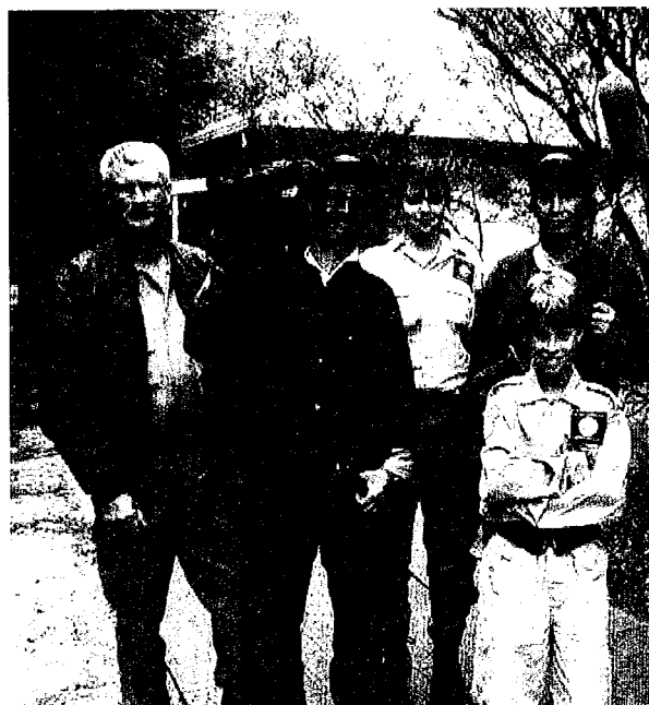
Channel 10 Tokyo filming the Roleystone Unit at CALM's Fire Management Services Reward Camp.

The CALM Bush Ranger program and its conservation projects are represented in all bioregions of the State. The following two maps depict the locations of Units and the locations of boarding schools involved in the program.