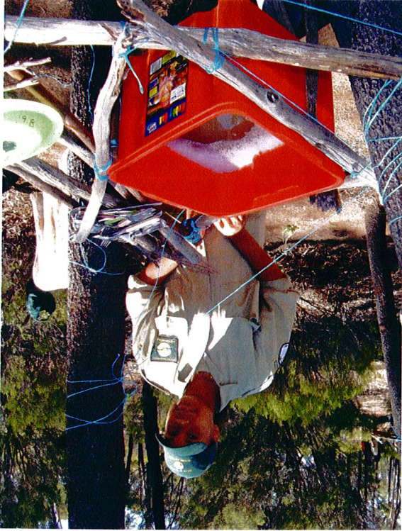
A Wongutha Bush Rangers cadet on a survival course at Bromus Bay.