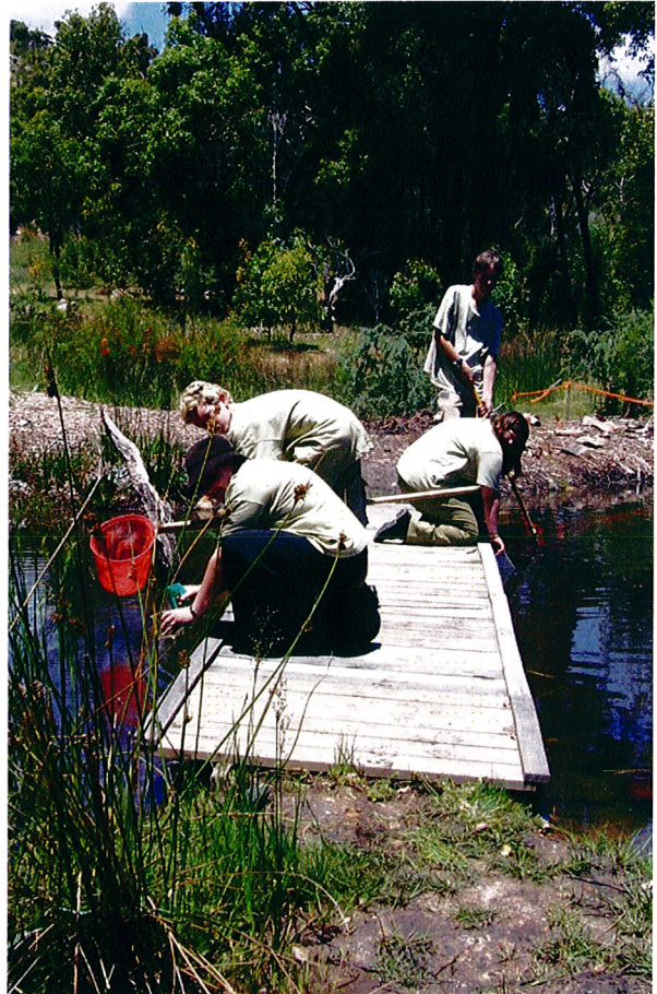
Southern River College Bush Rangers monitor macroinvertebrates in the creek on Hillside Farm in Gosnells.

The types of projects undertaken were determined by what the units were interested in, practical and logistical considerations and the availability of human and other resources. This year it included working with the Rubibi people in Broome on their interpretation trail, planting habitat and food for Carnaby's cockatoos, monitoring and handling chuditch and woylies as part of the fox baiting recovery project, monitoring malleefowl nests in the mid wheatbelt, completing rehabilitation work on local bush land, zoo food growing and collection, completing tasks at Shark Bay World Heritage Area and rock-wallaby surveys at Esperance and Merredin.