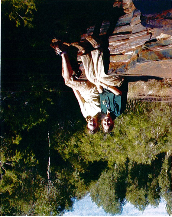
Newman Senior High School Bush Rangers assisted park rangers maintain trails in Karljini National Park.

By the end of 2005, the strength and credentials of the program were such that Cadets WA approved a 25 per cent increase in the number of Bush Rangers units across WA to start in 2006. This includes remote community schools, another education support school as well as schools from the independent, catholic and government sector. The successful partnership between CALM and bodies such as Cadets WA and the education sector has accumulated a monetary and in-kind wealth for exceptional opportunities for young people, exclusive to WA.