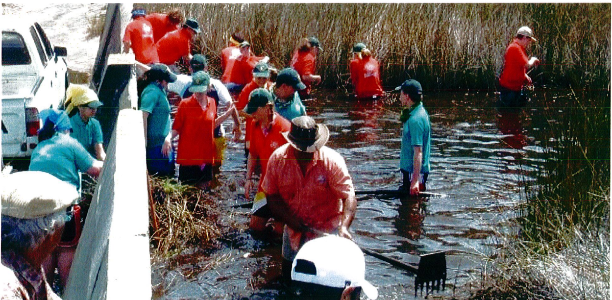
Esperance Senior High School Bush Rangers assisted in the management of cultural sites at Cape Le Grand National Park.