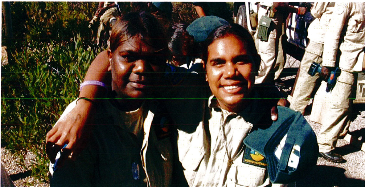
Wongutha CAPS Bush Rangers at Cape Le Grand National Park installing fluorescent markers on the trail to Frenchman's Peak.