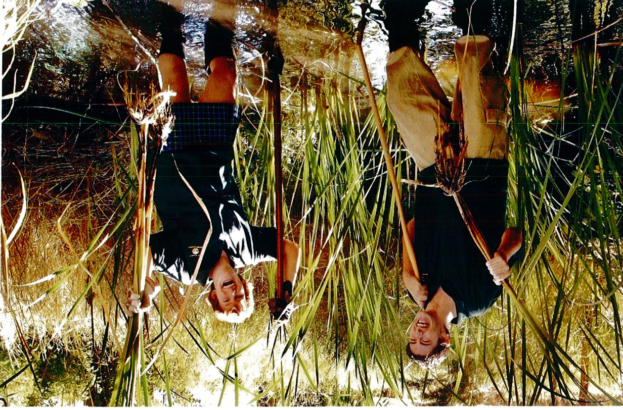
Rossmoyne Senior High School Bush Rangers have undertaken rehabilitation at Bull Creek since 1998.