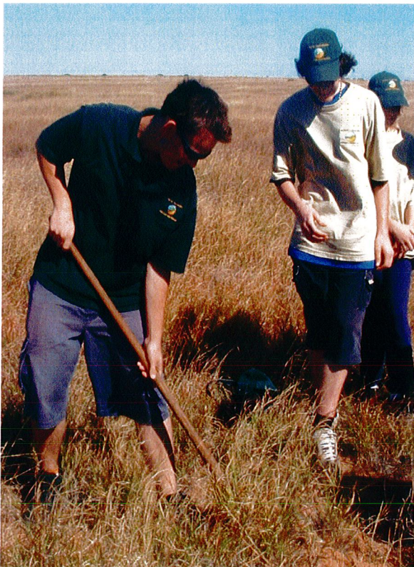
Mt Lawley Senior High School Bush Rangers constructing pit traps to monitor native animals at the Shark Bay World Heritage Area.

Each April and October, CALM's staff in CALM's Science and Parks and Visitor Services divisions in the Shark Bay World Heritage Area have provided Bush Rangers with unique practical experience in bilby and other rare native animal breeding programs. Cadets also assisted national park staff with manual work and helped feed the dolphins at Monkey Mia. This reward combined the exceptional with the every-day work of staff in these areas. Now in its fourth year, 240 cadets and instructors have taken part in this reward.