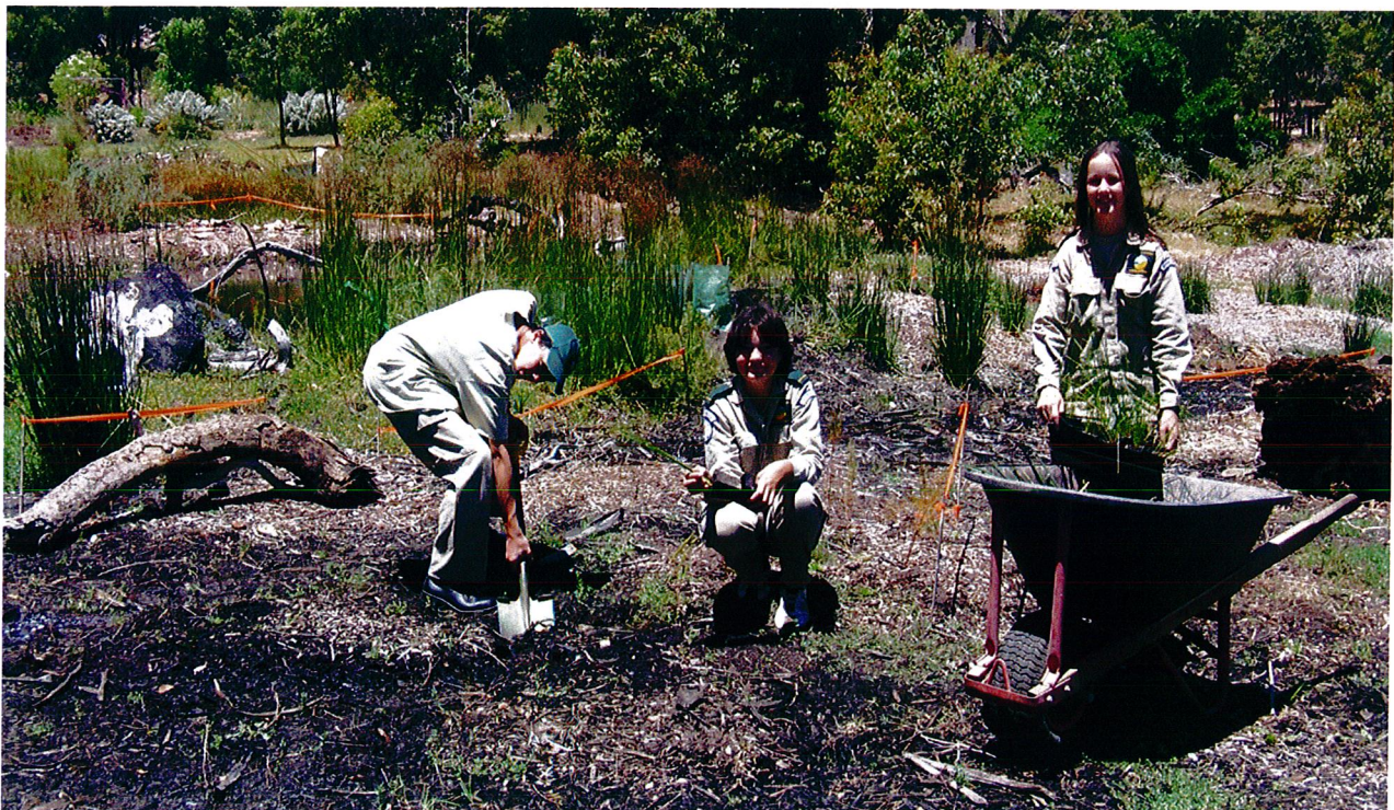
Southern River College Bush Ranger unit rehabilitate a creek line of the Hillside Farm in Gosnells.