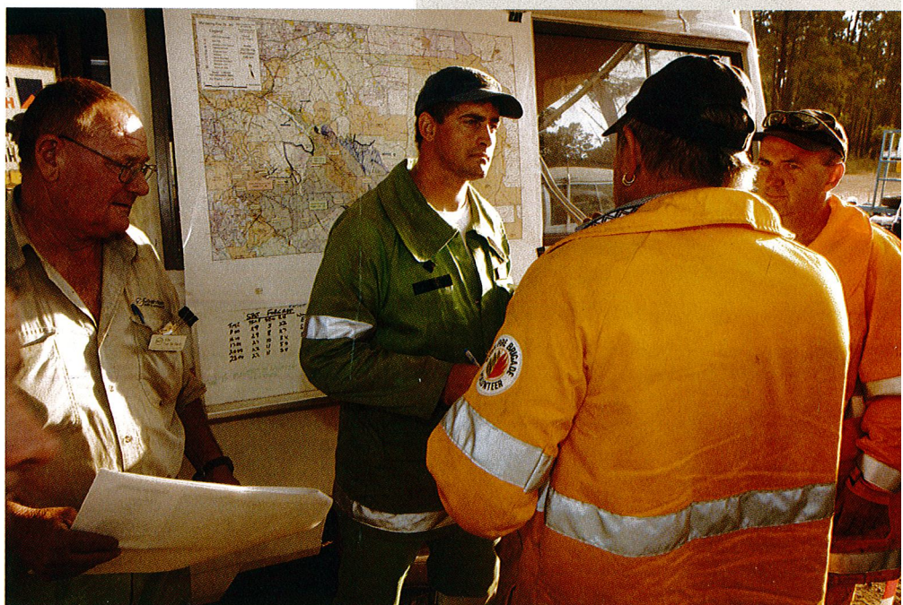
Fire crews from CALM, FESA and the volunteer brigades at the January 2005 Perth Hills Fire

There were more than 315 CALM and Forest Products Commission people assisting firefighters in their efforts.