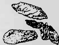
Southern Brown Bandicoot