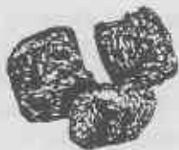
Western Grey Kangaroo