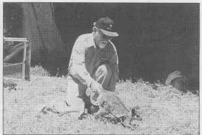
"Off you go, girl!" - Jack Kinnear