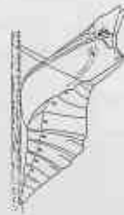
Generalised White pupa