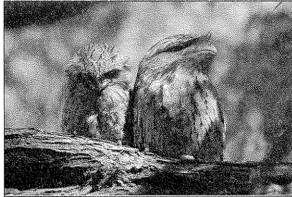
"Mother and baby"