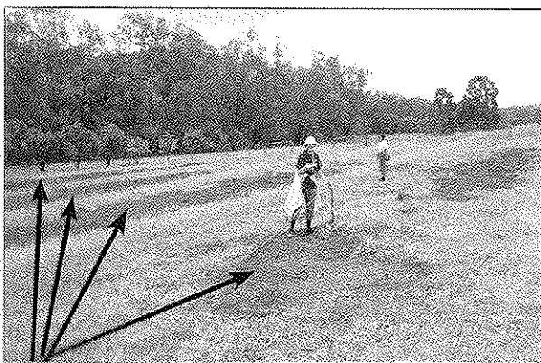
Pig damage. Wendy is holding broken reticulation.

The weather cleared as the group set out on a walk up the valley slope to where the lateritic plateau begins and a fenceline denotes the end of the previously grazed area.