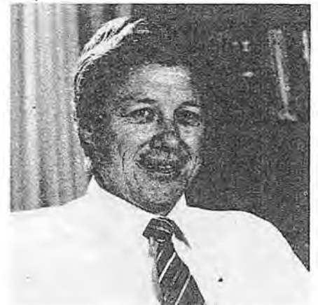
Ecoplan volunteers to share their ideas and experiences."

I also hope it will serve as a forum for