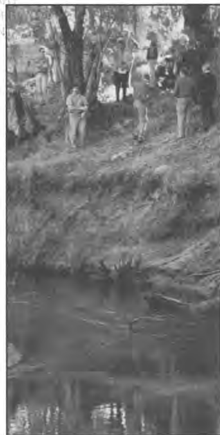
Participants discuss river rehabilitation during the Bunbury Ecoplan training day

Bernhard Bischoff invites people to create local friends groups to care for sections of the critically important