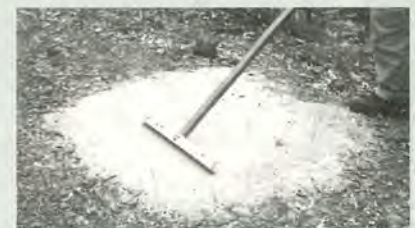
Smoothing a Sand Pad

As fauna is likely to move through your bushland and not simply within your allocated area, there are several ways to monitor their movement such as tracks, diggings, droppings and soil disturbance. Sand patches are a useful technique used to show animal tracks thus enabling you to identify fauna in the area. Monitoring the behavior of fauna in your bushland such as, breeding and food collection will provide you with a good indicator as to the health of the area.