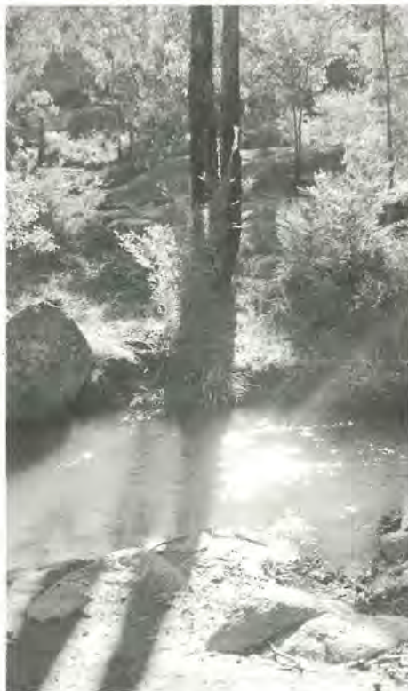
Piesse Brook

Each year the FoPB focuses the efforts on one section, then carries out spraying and removal of weeds within that section. In the second year, fresh outbreaks of weeds are hand wiped and sprayed, while native seedlings are planted in areas where weeds have been successfully eradicated. In the third year a final hand wipe and spraying of glyphosate is conducted, in order to