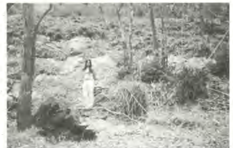
Above: A site within Piesse Brook before the weeding program by the group was implemented. Below: The same site after the extensive weeding program was implemented