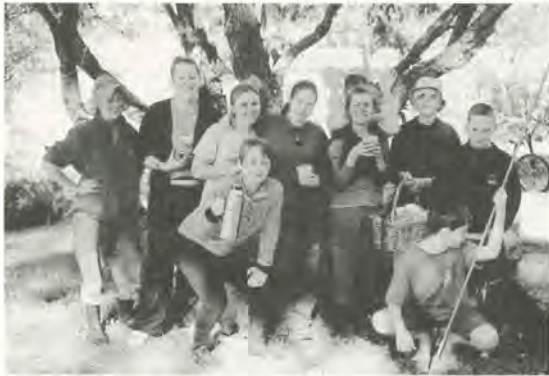
Friends of Lake Claremont at a planting day in July!

Three new volunteers joined the group and have expressed an interest in helping with the water quality monitoring which will be starting soon, as the funding has now been approved by council.