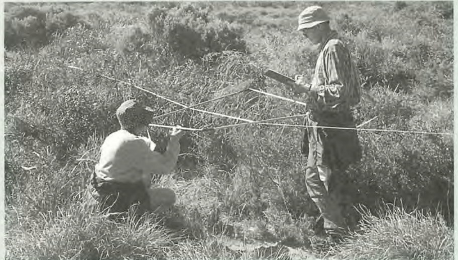
Setting up a transect line at Port Kennedy