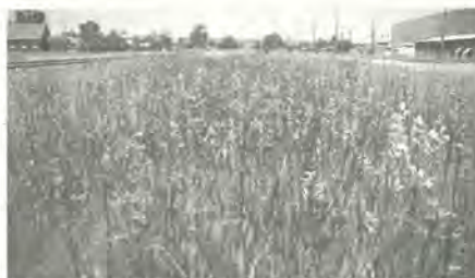
Watsonia looks pretty to the unknown eye, however is wrecking havoc throughout WA