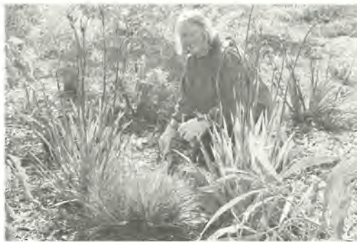
Women in Landcare workshop encourages senior women to actively participate in environmental activities.

The North East Catchment Committee (NECC) and the Office for Women's Policy are acutely aware of the significant value that women over the age of 40 have in the landcare arena and want to provide more women with the skills to actively participate in this field.