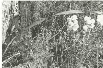
Flower Power, Acacia wildenowiana

This month the Friends of Shenton Bushland (FoSB) finally had the opportunity to celebrate their 10th birthday with a picnic and a walk from Shenton Bushland to Perry Lakes.