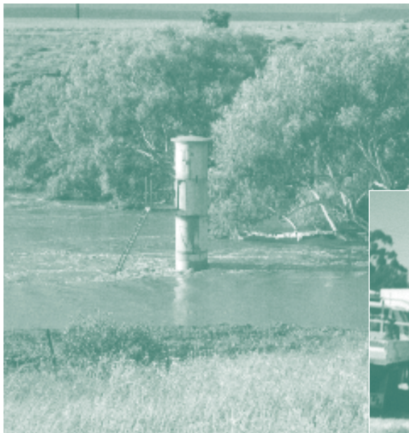
Measuring and monitoring water resources and water quality provides the information to guide planning and sustainable development.

Unconfined groundwater can also be important for water supplies. The largest unconfined groundwater source currently used for water supply is the Gnangara Mound just to the north of Perth. Deposits of sand, gravel and limestone near river beds can also yield groundwater supplies.