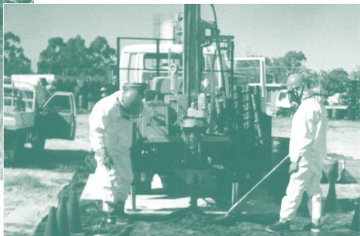
Groundwater in some areas has been polluted by industry or other land uses. The extent and severity of the pollution can be assessed by drilling and constructing monitoring bores.

The annual renewable amount of groundwater in Western Australia's sedimentary basins that is fresh enough to contribute to water supplies is estimated to be about 2500 gigalitres per year, of which approximately 1400 gigalitres is in the Perth Basin. This is about twelve times Perth's current scheme water consumption.