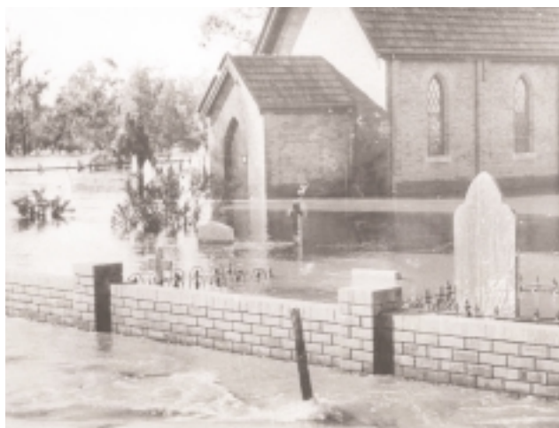
PINJARRA - St John's Church during 1945 Murray River flooding.

Flooding is more likely to occur in certain seasons of the year. Floods in the north-west of the State are more likely to occur in the summer cyclone season while floods in the south-west are more likely to occur in winter. The impacts of land clearing, urbanisation, high groundwater levels and saturated soil can lead to increased levels of flooding.