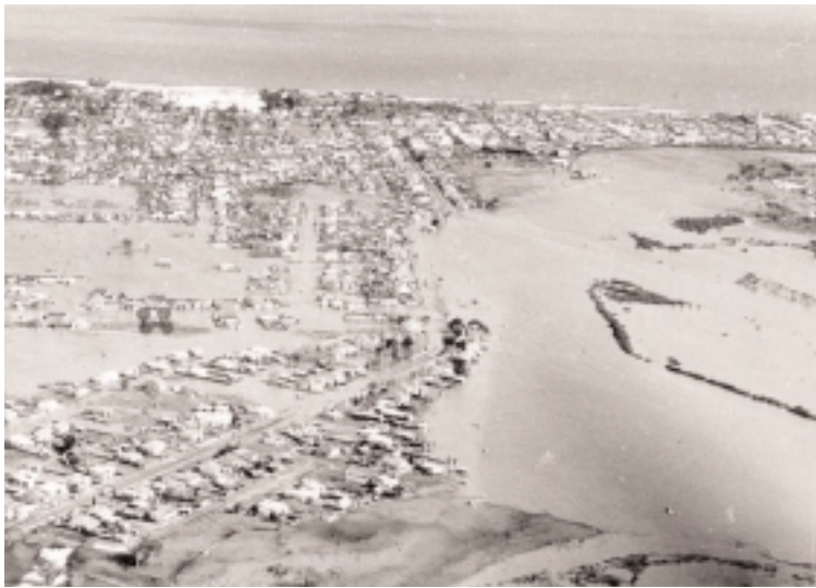
BUNBURY - Preston River levees breached during 1964 flooding.