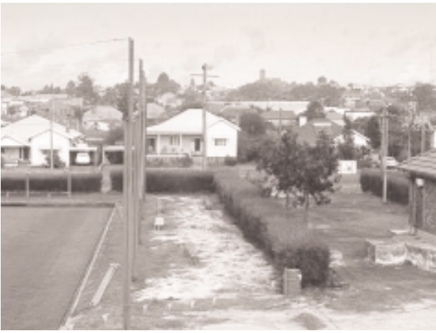
COLLIE - Same view when Collie River not in flood.