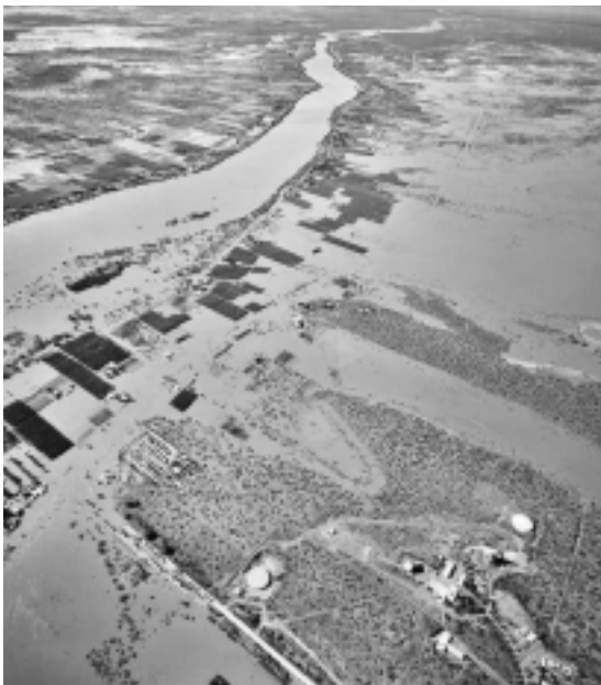
CARNARVON - Looking upstream from Brown Range during 1980 Gascoyne River flooding.