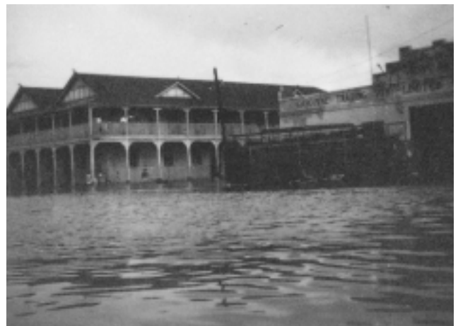
Flooding at Robinson Street in Carnarvon in 1951 prior to levees being built.

The average annual flood damage cost for Australia is $350 million of which Western Australia's share is $17 million. Western Australia's average annual flood damage cost is modest compared to the other states as the average annual damage cost for both New South Wales and Queensland is over $270 million a year. Our low figure reflects a smaller population and a more benign flooding regime.