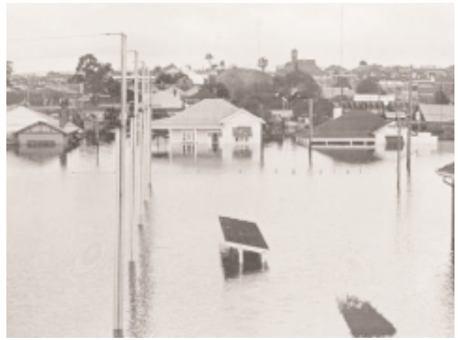
COLLIE - Medic Street during 1964 Collie River flooding.