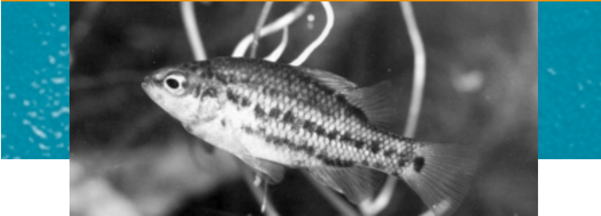
Ewans pygmy perch (Nannoperca variegata) a vulnerable species found in Victoria.