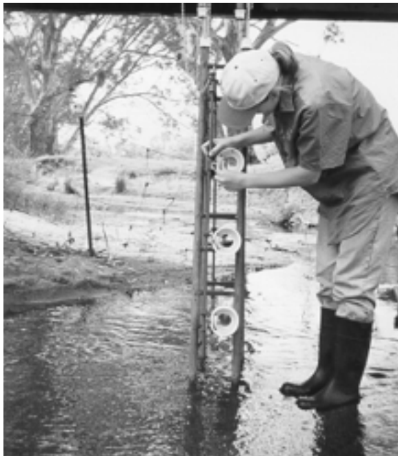
A suspended sediment sampler is used to detect the amount of sand in a water sample