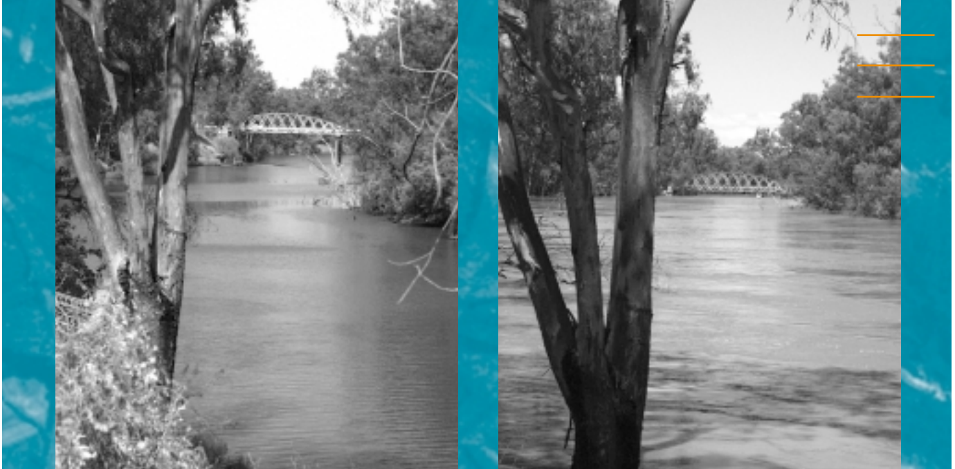
Floods dramatically change the nature of lowland rivers, sometimes raising the flow speed by several orders of magnitude. Macintyre River, Goondiwindi, Queensland during October and November 2000.

The project will also assess the potential impact of hydrological fragmentation of anabranches upon carbon availability and transfer to the riverine ecosystem. The work will concentrate on a series of anabranches between Goondiwindi and Mungindi, and Heather will work from the Northern Laboratory during the field work components of the project.