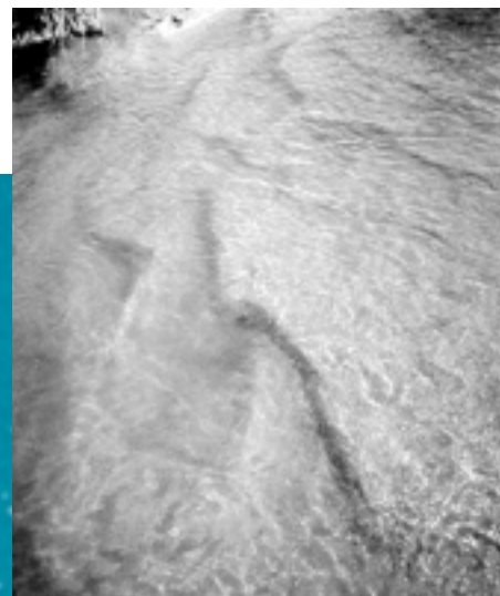
Sand dunes migrating along Creightons Creek.