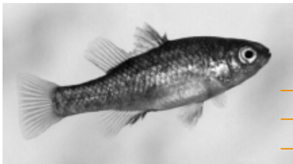
Pygmy Perch (Nannoperca sp.) Genetic studies have revealed what appear to be two new species of pygmy perch.