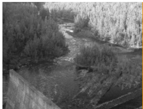
Similar groups of invertebrates recolonised all sites after the disruption of dam building. Tallowa Dam on Shoalhaven River, NSW.