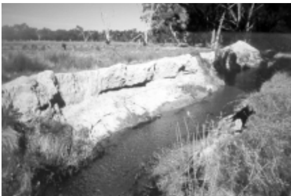
Eroding streambanks in the lower reaches of Creightons Creek.

Through major sampling and measuring exercises, other researchers in the Granite Creeks project now have an extensive knowledge of the fauna in the creeks. Restoration work, incorporating local landholders and Landcare groups, will now concentrate on two creeks. The research team intends to place specially designed timber structures in selected sites in sandy streams,