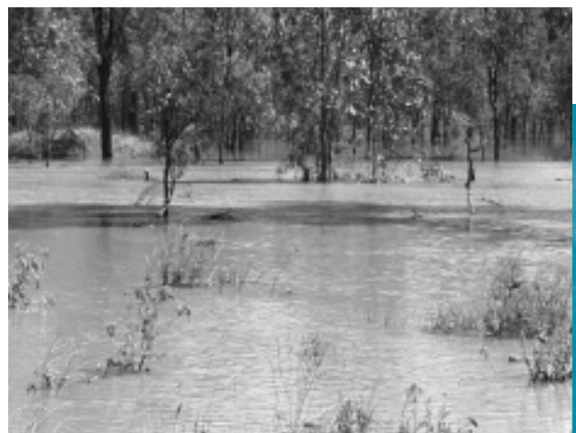
Rivers are recharged with a massive dose of organic material when floodplains are inundated during floods. Macintyre River, Queensland.

Heather's research will involve pre, during and post-flood monitoring of the large scale pools, inputs and outputs of total organic carbon, particulate organic carbon and dissolved organic carbon in each of several anabranches and in the adjacent main channel.