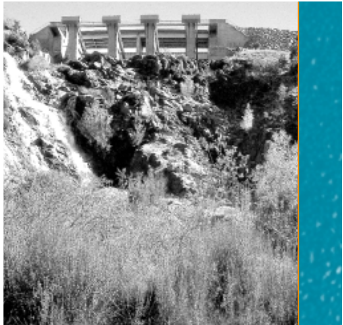
About 40% of the families of invertebrates predicted to occur below the dams had been eliminated. Jindabyne Dam on Snowy River, NSW.

At all sites taxa such as worms (Oligochaeta), midge larvae (Chironominae and Orthocladiinae), water mites (Hydracarina), various caddis larvae (Hydropsychidae and Hydrobiosidae) and certain Gripopterygid stonefly nymphs and Baetid mayfly nymphs were predicted to occur and were observed (these taxa are tolerant of the altered conditions produced by dams). On the other hand Leptophlebiid and Coloburiscid mayfly nymphs, Elmids and Psephenid beetle larvae, and a number of other families (e.g. Tipulidae, Corydalidae, Leptoceridae, Glossosomatidae, Conoesucidae, Calocidae) were commonly predicted but were seldom observed (intolerant taxa). In addition, some taxa with a low likelihood of