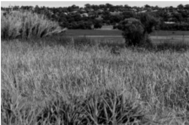
Weed invasion at Lake Joondalup. Grassy weeds in the foreground and giant reeds ( Arundo donax ) in the background.

frequency resulting in the loss of native trees and shrubs. It should be mentioned however, that certain aquatic weeds, such as bulrush ( Typha orientalis ) make excellent waterbird habitat.