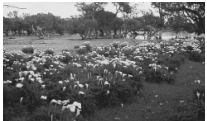
Arum Lily ( Zantedeschia aethiopica ) is a highly invasive weed species.