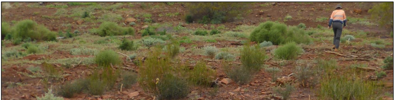
Below: Post-restoration on a mine waste rock dump.

To define and achieve a scale-appropriate restoration target, several spatial scales must be taken into account (in this case: the species pools for the 0.86 ha research trial area, the 7 ha target restoration area, the entire habitat of the TEC, and associated communities). Spatial scales are represented by the nested boxes. Survey sources used for each nested box for this study are vertical text in italics.