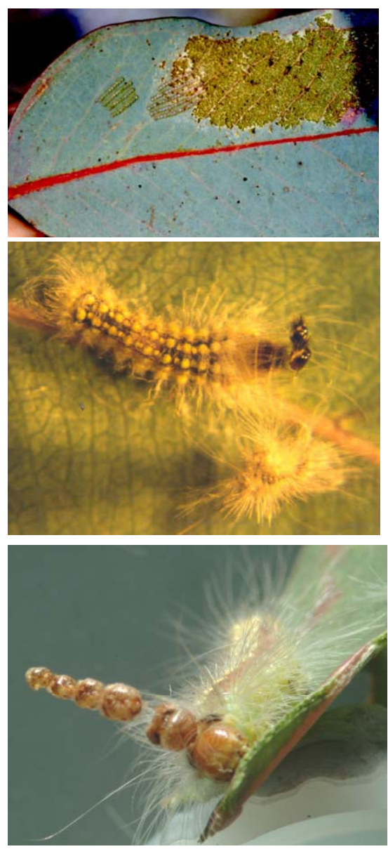
Top: egg rafts and early feeding pattern of GLS larvae. Middle and bottom: late stage larvae showing head capsule retention, a characteristic of this moth species

The biology of GLS in the southern jarrah forest was investigated and compared to previously known features of this species from eastern Australian studies. In addition aerial and observational survey data were used in a Geographic Information System (GIS) analysis to examine the possible impact of forest management and vegetation type on this insect.