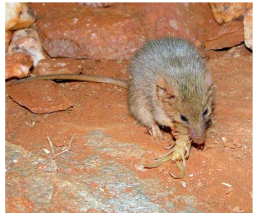
Pilbara ningai ( Ningai timealeyi )

Data on the occurrence of small (<50g) ground-dwelling mammals were collected as a part of a larger study documenting biodiversity patterns in the Pilbara. Subsequently, environmental variables influencing the occurrence of individual small ground-dwelling mammal species in the region were identified using a complex modelling approach called multivariate adaptive regression splines (MARS). Co-occurrence patterns based on known habitat associations throughout wider ranges in the Pilbara and/or elsewhere in Australia were also examined.