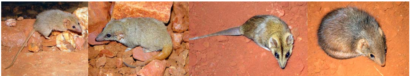
Planigale sp. ( Planigale sp 1)

Gibson LA, McKenzie, NL (2009). Environmental associations of small ground-dwelling mammals in the Pilbara region, Western Australia. Records of the Western Australian Museum Museum, Supplement 78 , 91—122.