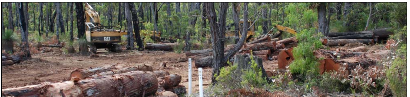
Above: Log landing in jarrah forest

The soil disturbance component of FORESTCHECK aimed to determine the intensity of soil compaction during timber harvesting in jarrah forest and the extent of disturbance across the harvested area (Whitford and Mellican 2011). The extent of soil disturbance was determined by mapping the boundaries of the harvested areas, the path of extraction tracks to landings and the size of landings. The intensity of soil disturbance was quantified by measuring soil bulk density, a measure of soil compaction.