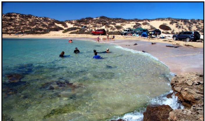
Tourists on the beach at Ningaloo. The presence of humans was not directly related to prevalence of coral disease along the Ningaloo Coast.