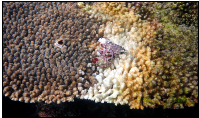
Feeding scars from coral eating snails, Drupella Spp. Prevalence of disease was related to the presence of feeding scars

Although human presence was not related to disease at Ningaloo, disease prevalence has previously been linked to anthropogenic derived disturbances at other locations. As human interactions with the reef increase, so too does the potential for greater disease prevalence. It is important therefore to have accurate and regular measures of human activities along the Western Australian coastline.