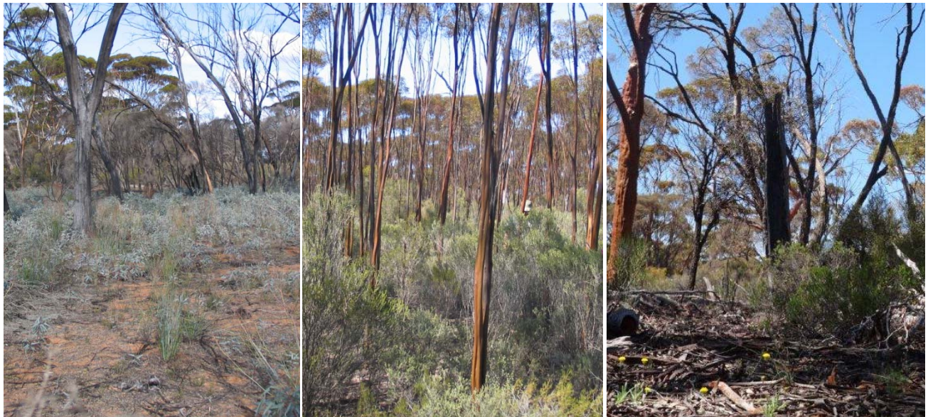
Left: A recently burnt (2 years post-fire) gimlet woodland, with regenerating Eucalyptus salubris , and the post-fire ephemeral Glichrocaryon spp. in the foreground. Centre: Gimlet woodland of an intermediate (~40 years) time since fire, showing high cover of 'pole' E. salubris and a dense shrub layer. Right: Mature gimlet woodland (> 200/450 years post-fire), showing lower tree and shrub cover, but more space at ground level for low shrubs, perennial herbs & grasses and annuals.