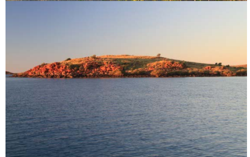
Features of the Dampier Archipelago.