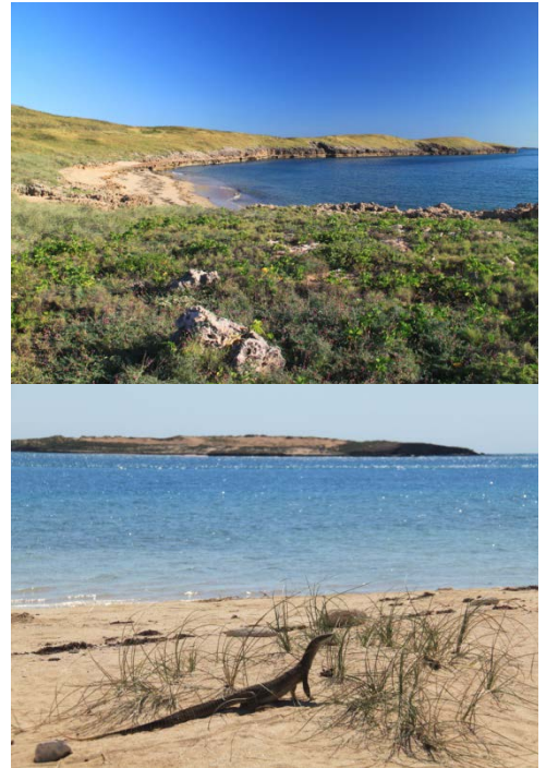
Montebello Islands.

With so many islands to manage, it is important that Parks and Wildlife has a system in place that assists in the prioritisation of management actions to maximise the conservation outcomes achieved given limits to resources and on capacity.