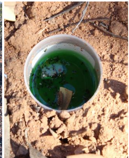
Gimlet woodland in the Great Western Woodlands (left), which were sampled for terrestrial ants with wet pitfall traps (40 mm diameter) filled with ethylene glycol, shown here (right) with captured ants prior to collection, sorting and identification.