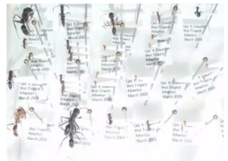
The CSIRO ant collection held at the Tropical Ecosystems Research Centre, Darwin, was used to identify and classify ants captured in this research.