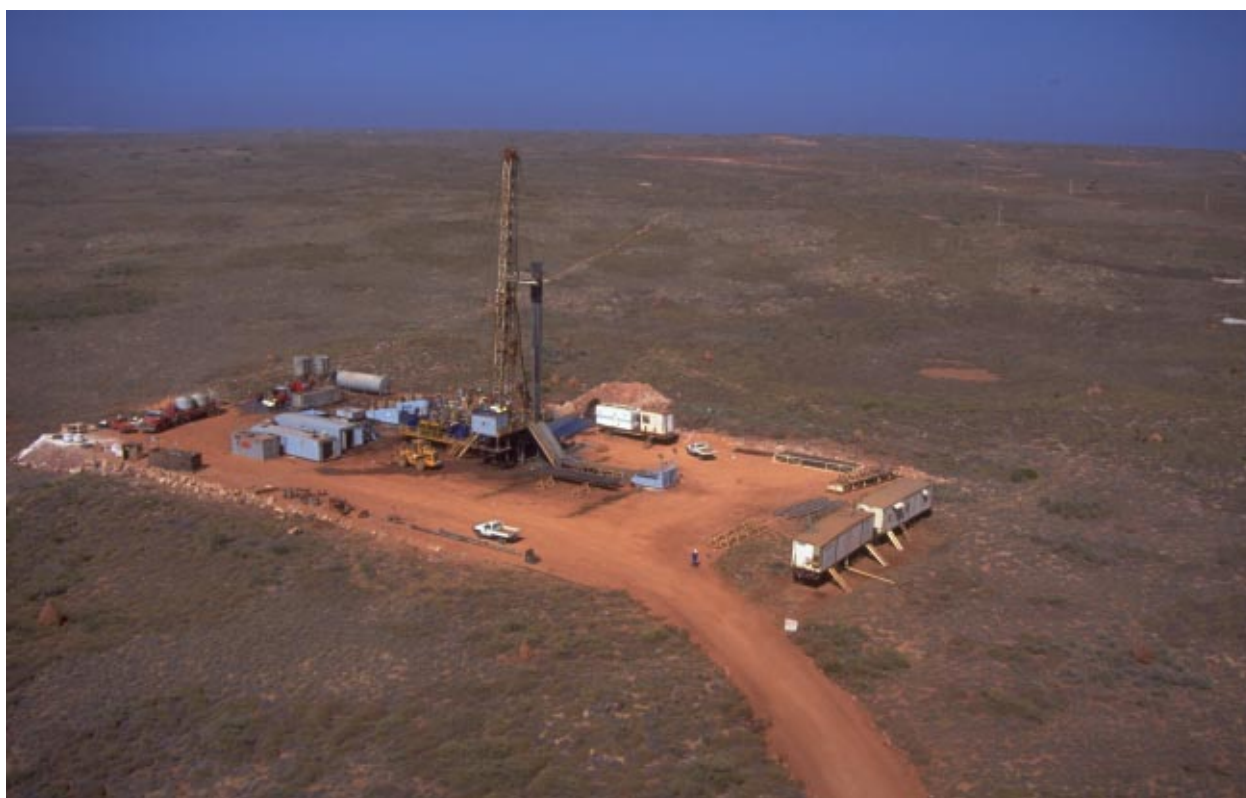
Drilling rig on Barrow Island

One of the first steps taken was to establish an independent Quarantine Expert Panel to provide advice to CVX on international best practice for the necessary