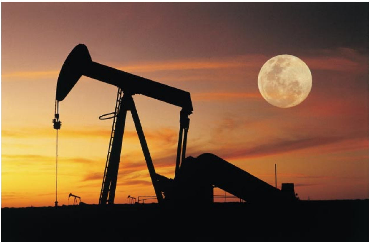
Luskin pump at sunset

In the 1950s, the island was visited by personnel associated with the testing of the first British nuclear weapon and was, for a while, considered as a potential site for these tests. By this time the value of Barrow Island to mammal conservation had been recognised and it was proposed that the native fauna could be herded to the southern end of the island, a fence constructed