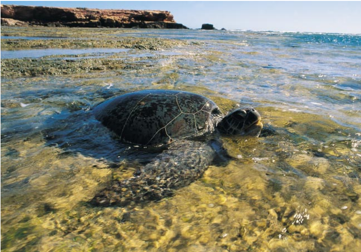
Green turtle (Chelonia mydas), west coast of Barrow Island

variability of capacity of key habitat areas needed to support the Western Australian dugong population provides the reason for the wider focus required. This must be taken into account in review of the current proposals for designation and management of new marine protected areas (MPAs) for the Western Australian Pilbara and other coastal regions extending into the Kimberley. This report includes data analysis to provide population estimates for the dugongs, sea turtles and small cetaceans (dolphins) recorded in the survey; sightings data have been mapped to show distributions of the dugongs, sea turtles and small cetaceans (dolphins) recorded on survey.