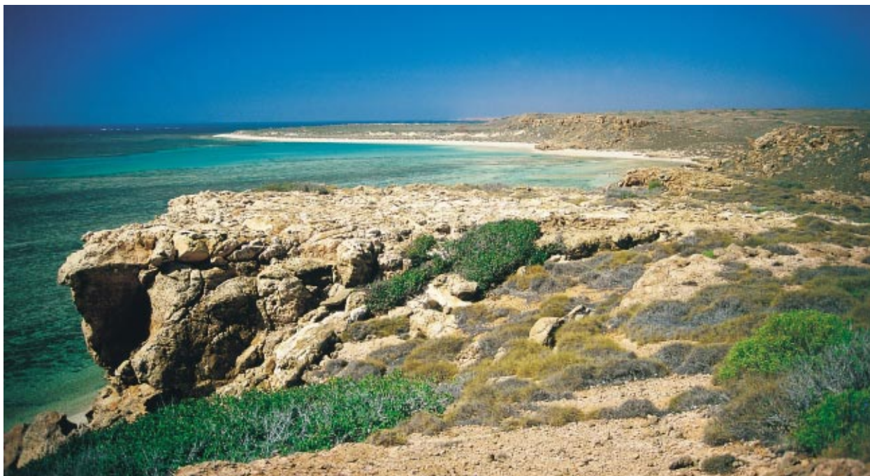
Turtle Bay, west coast of Barrow Island

troglotic and stygobitic fauna are found in its caves and groundwater. Located 80 kilometres off the Pilbara coast west of Cape Preston and north of Onslow, this 233 km 2 island is unique in being a producing oilfield with over 900 wells and other items of associated infrastructure as well as being a very valuable biodiversity conservation reserve. It is the intact array of native