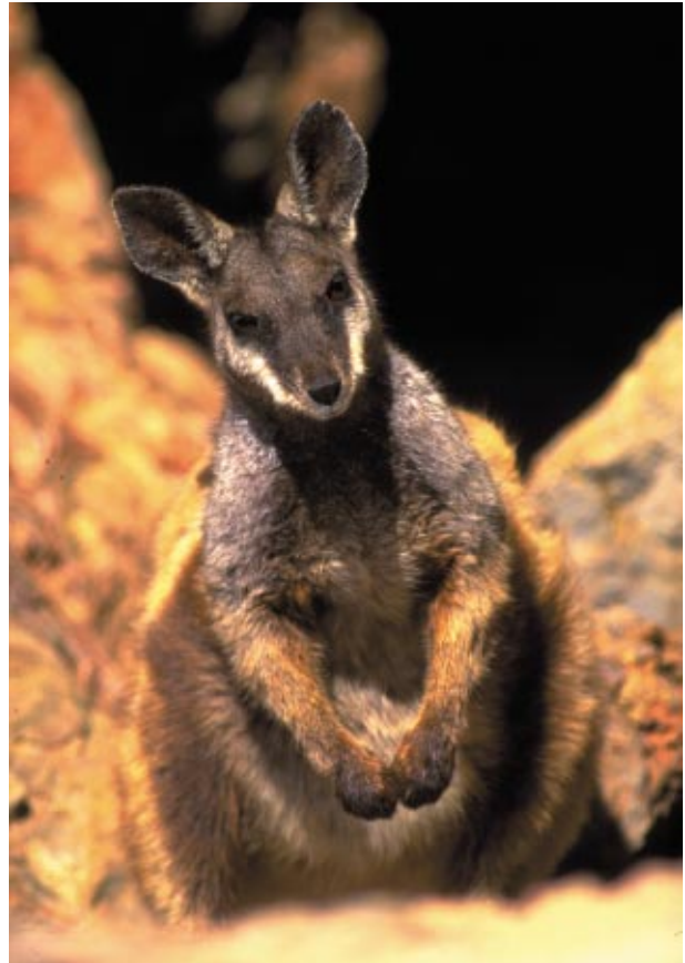
Black-footed rock-wallaby ( Petrogale lateralis lateralis )

Summary: It has been argued that demographic and environmental factors will cause small, isolated populations to become extinct before genetic factors have a significant negative impact. Islands