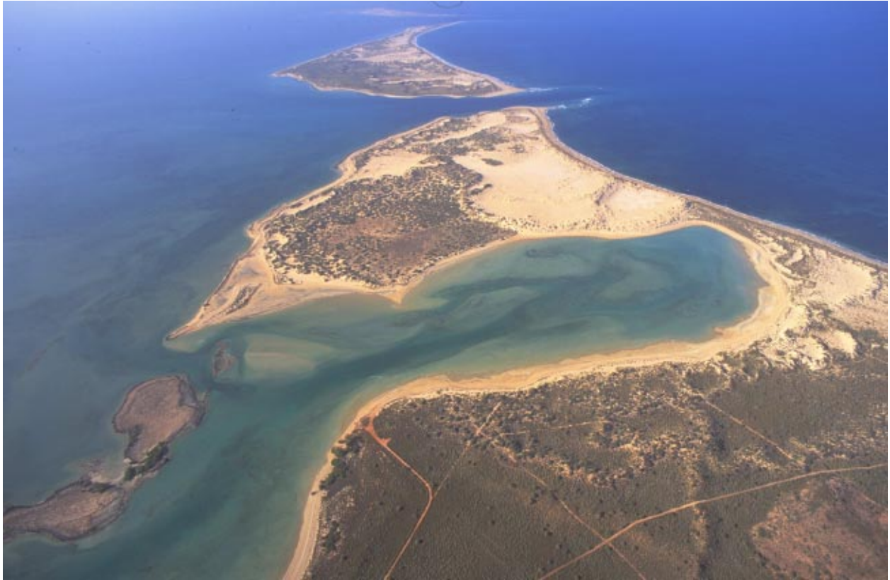
South End, Barrow Island