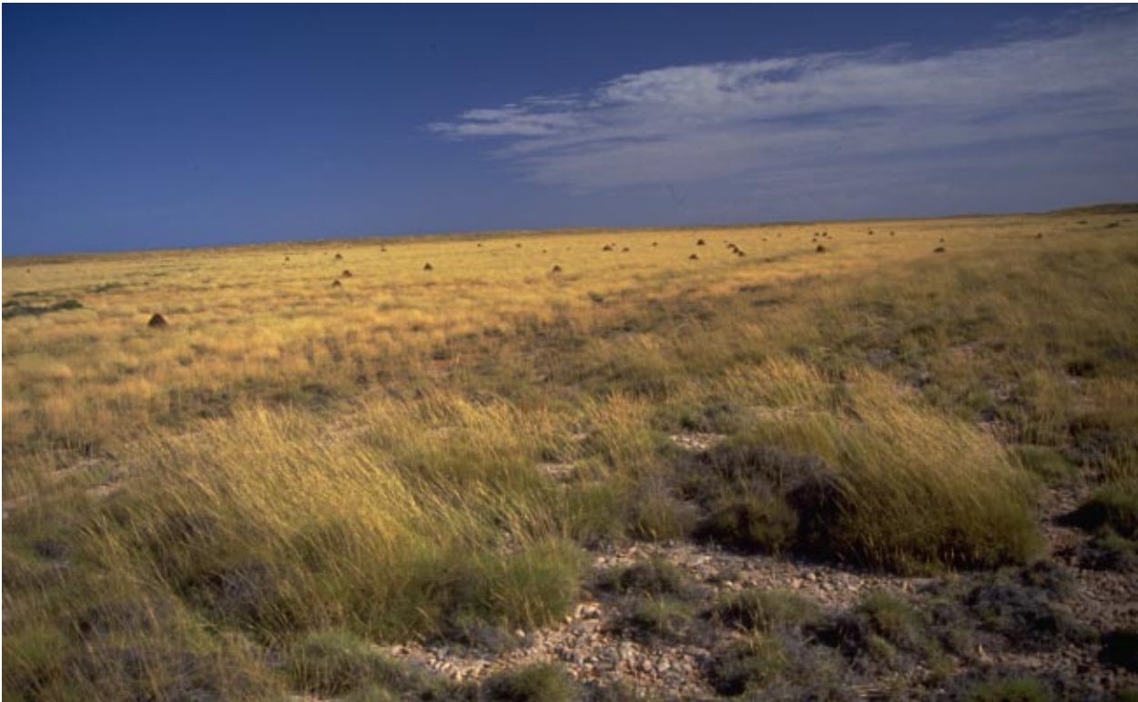
Spinifex grassland on Barrow Island

Summary: This paper records the first Psocoptera known from Barrow and Boodie islands, off the west coast of Western Australia. Liposcelis entomophilus (Enderlein), Caecilius sp., Peripsocus fici sp.n. and Barrowia insularis gen. et sp.n. occur on Barrow Island; Cladioneura foliata sp. occurs on both Barrow and Boodie islands.