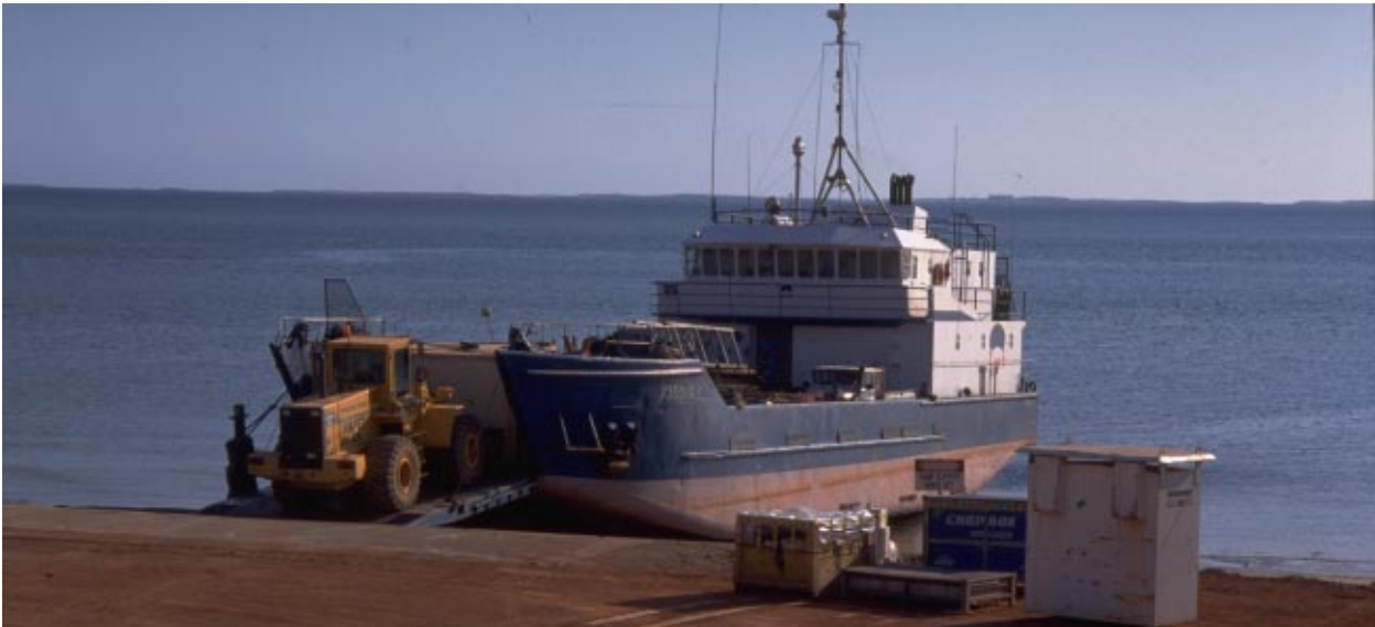
Barge at WAPET Landing