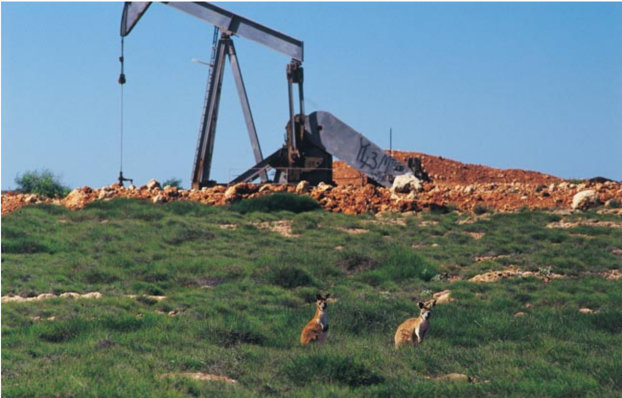
Barrow Island euros (Macropus robustus isabellinus)