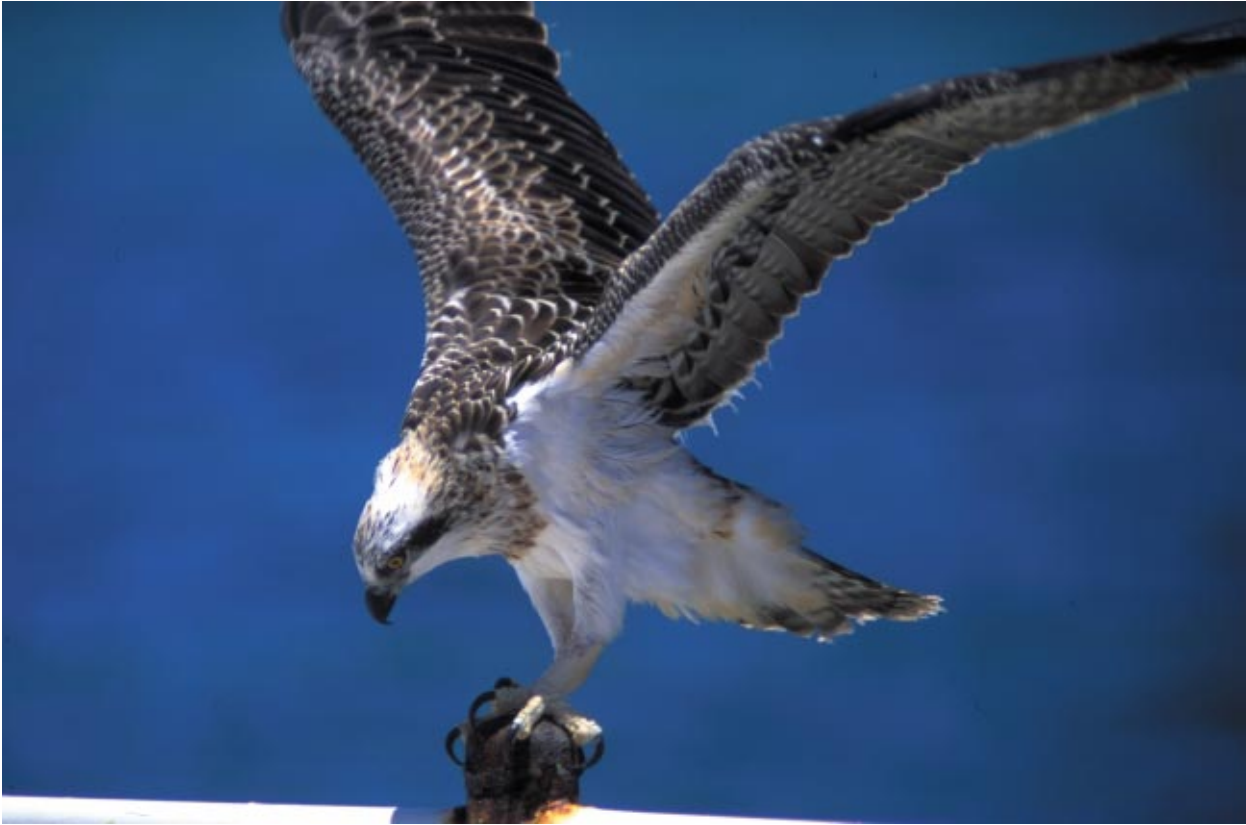
Osprey (Pandion haliaetus)

Summary: The vegetation mosaic hypothesis suggests that medium-sized mammals occupying arid and semi-arid areas of Australia require a habitat that is a fine-grained mosaic of different vegetation types or seral stages. This mosaic is believed to have been created in the spinifex deserts of central Australia by Aboriginal burning practices. Its loss in the period 1940–1960 is postulated to be a primary reason for both major reductions in range and mainland extinctions of many species of medium-sized mammals at this time. This study measured the responses of three species of medium-sized mammals to vegetation patterns within spinifex grasslands that ranged from comparatively uniform to highly diverse. The abundance, condition, and reproductive status of golden bandicoots, northern brush-tailed possums, and burrowing bettong were assessed with vegetation mosaics of various scales on Barrow Island, off the northwest coast of Australia. Scale of mosaic proved to have no significant effect on the numbers, condition, or reproductive status of any of the three species. Similarly, the creation of fine-grained mosaics of early seral-stage vegetation mixed within climax vegetation by extensive oil-field operations over nearly half the island had no significant effect on the number or condition of animals. Hence, scale of mosaics seems unlikely to be related to the mainland decline or extinction of these species. The pattern of decline and