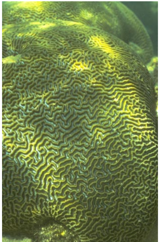
Corals in the proposed Montebello/Barrow Islands Marine Conservation Reserve

Summary: The Marine Conservation Branch of the Department of Conservation and Land Management has undertaken the mapping of the distribution of marine wildlife for the study areas of the proposed Montebello/Barrow islands and the Dampier Archipelago/Cape Preston marine conservation reserves. The information has been compiled and incorporated into a map, which has been prepared as a contribution to the planning processes underway for these two proposed marine conservation reserves. Areas of high conservation value, in relation to marine wildlife, have been