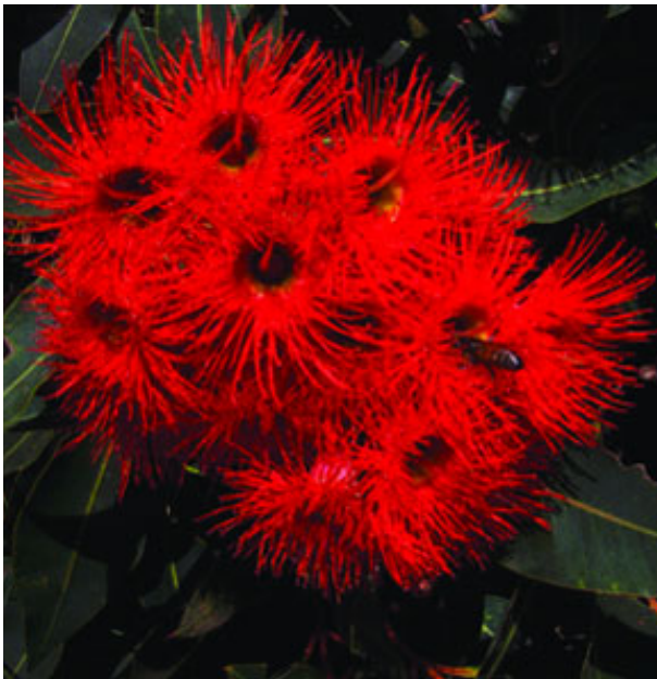
Plant of the month: Corymbia ficifolia

Take a look at our plant of the month on www.naturebase.net/florabase/ .