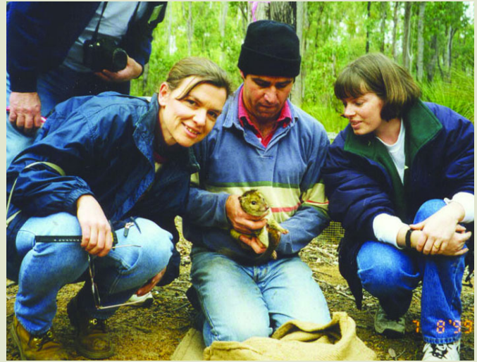
Weighing a chuditch (western quoll) during a teachers' Western Shield camp.

As I write, staff from the South Thornlie Primary School are visiting the centre. This PD day is a great way for them to ease into the year with a wealth of curriculum linked resources and ideas for all learning areas - a stimulus for the whole school to work together effectively during the year on the values of environmental responsibility.