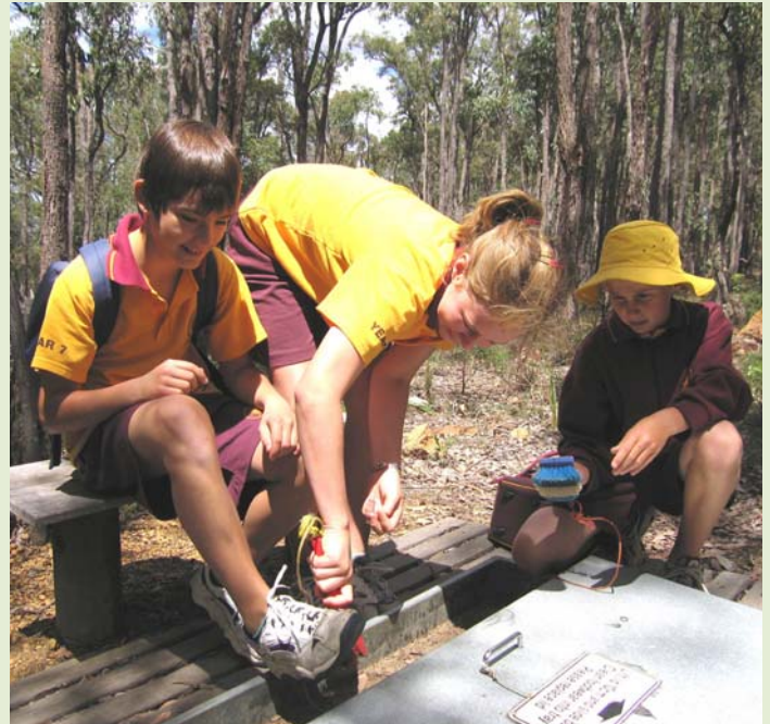
Students 'getting out into nature' – hands-on learning on the Catchment Carers' Trail.