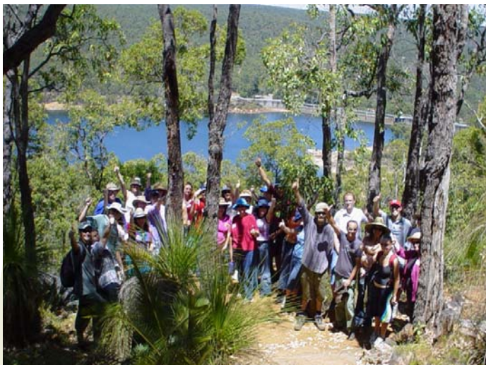
Teachers taking a break from 'monitoring' on the Weir View Walk during a Professional Learning (PL) opportunity in the Perth Hills.