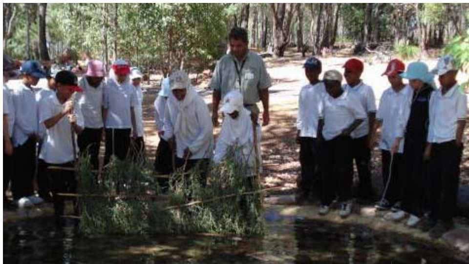
Students and teachers from the Australian Islamic College celebrate Harmony Week with EcoEducation Aboriginal leaders.

Judging by the large number of bookings for the Aboriginal programs in Term 2, EcoEducation will continue to promote the spirit of harmony this semester.