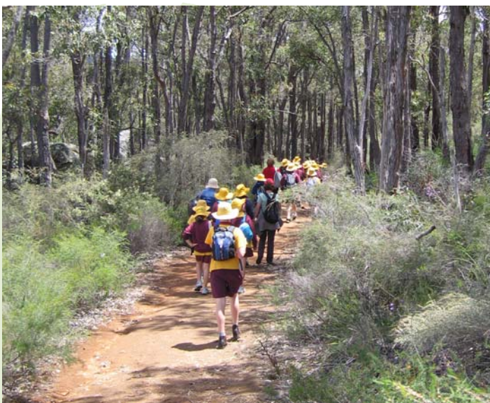
Students walking along the Bibbulmun Track on a Healthy Parks, Healthy People excursion. By the end of the day they had picked up tips on safe bushwalking, signaling, compass navigation and the Forest Code of Conduct.