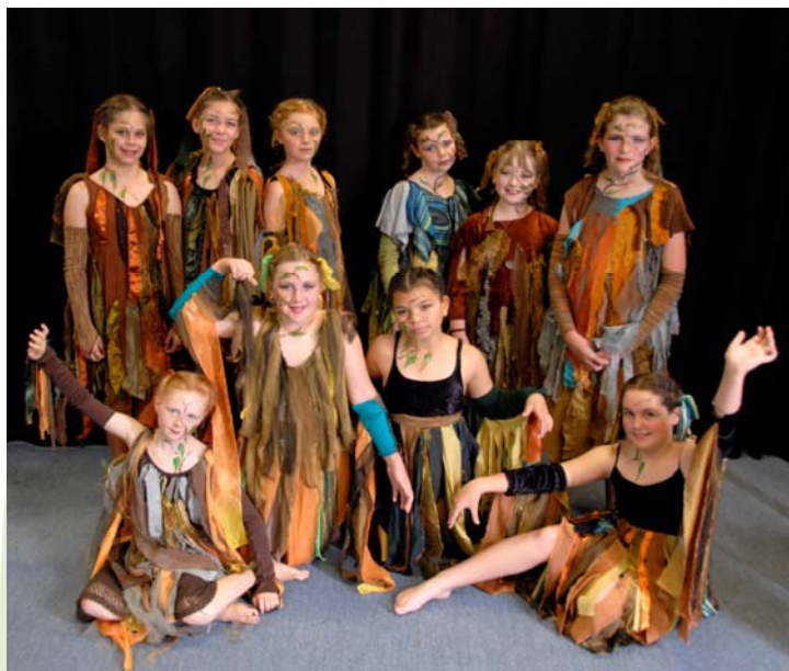
Talented Armadale Primary School students helped to spread the message 'Stop the Rot' at the J Rock festival last year. The 'rot' refers to dieback disease, which attacks hundreds of plant species in many areas in the south-west.

Teachers will be introduced to the new Dieback Education Kit at a Professional Learning opportunity on 23 November. For enquiries please phone 9374 3312 or 0438 044 488.