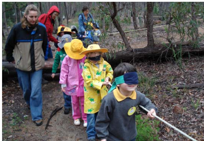
Glen Forrest Primary School students test out their sense of touch on the Sense-ational Trail.