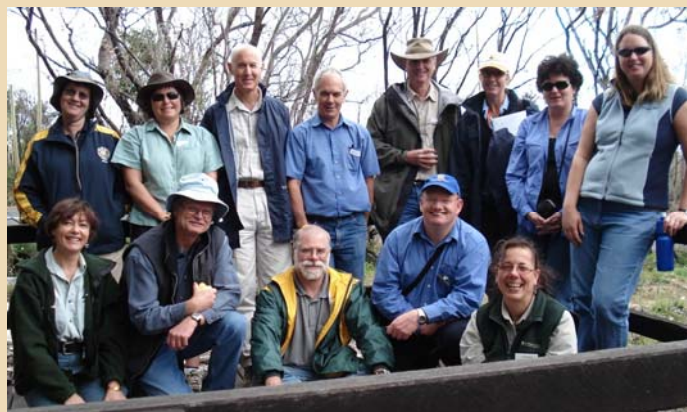
Teachers and DEC staff members at Calgardup Cave, the site for fieldwork on the Fire – A force of life excursion.