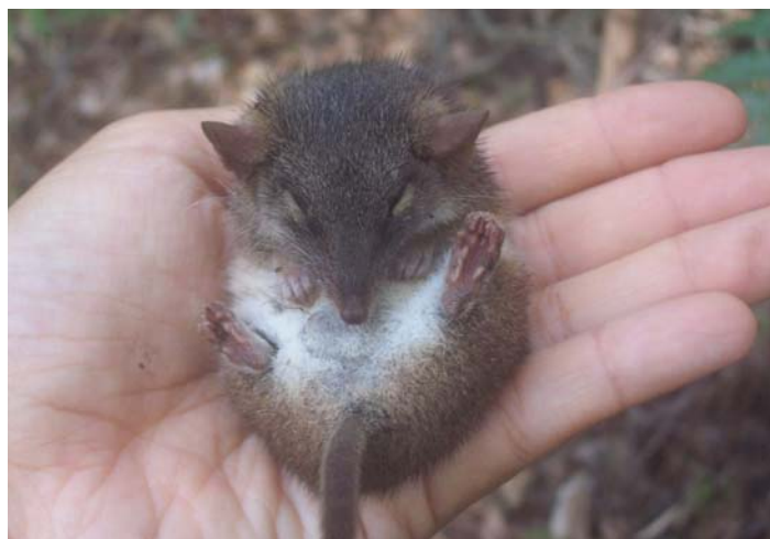
Sleeping mardo.

This year the Monitoring Marsupials program will be offered free of charge to students camping at WDF or MREDC. There will also be $150 bus sponsorship to assist with the rising cost of excursions. Book early as places are limited.