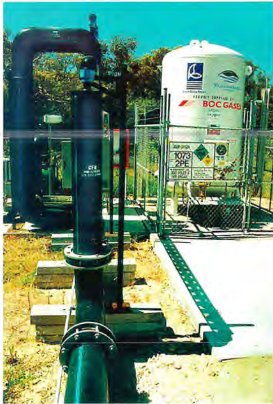
Oxygenation plant on the Canning River. Pipes distributing oxygenated water are in the foreground. Behind them are the oxygen dissolver (left) and liquid oxygen vessel (right).

2) High levels of organic matter entering and accumulating in waterways. Unmodified waterways often have wetlands or dense fringing vegetation that filters out a lot of organic matter before it enters the main waterway. If these mechanisms are removed or decreased in efficiency more organic matter will enter the waterway.