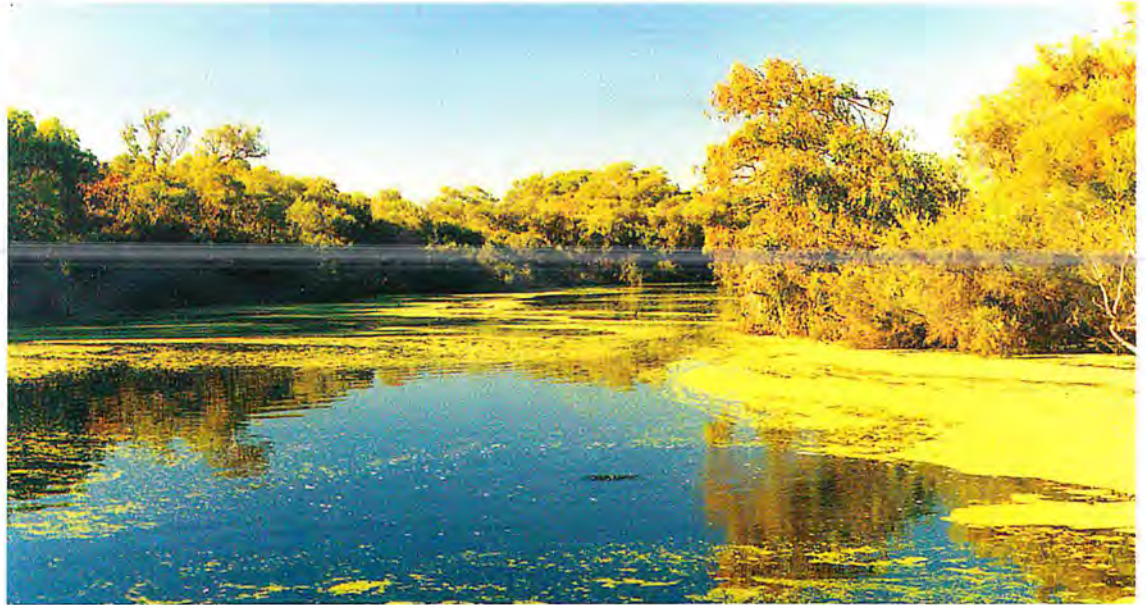
Part of the oxygenated area of the Canning River. Rafts of the floating macrophytes azolla and lemna like this are occasionally seen in summer.

In summary, we can see that oxygenation helps the permanent removal of carbon and nitrogen from the ecosystem, and temporarily suppresses phosphorus release. All of these outcomes help prevent the conditions that lead to the formation of phytoplankton blooms. Anoxic events that result in mortality and the loss of biodiversity through the accumulation of the toxic by-products of anaerobic bacterial processes (eg hydrogen sulfide gas, methane, ammonia) and severe anoxia are also reduced.