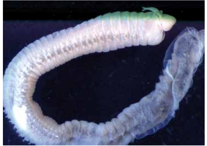
Figure 10 Polychaete Marphysa sanguinea or blood worm, commonly used as fishing bait.

The ability of whiting to ingest large amounts of polychaetes is facilitated by their small and protrusible mouth, which enables them to ‘suck up’ this food source.