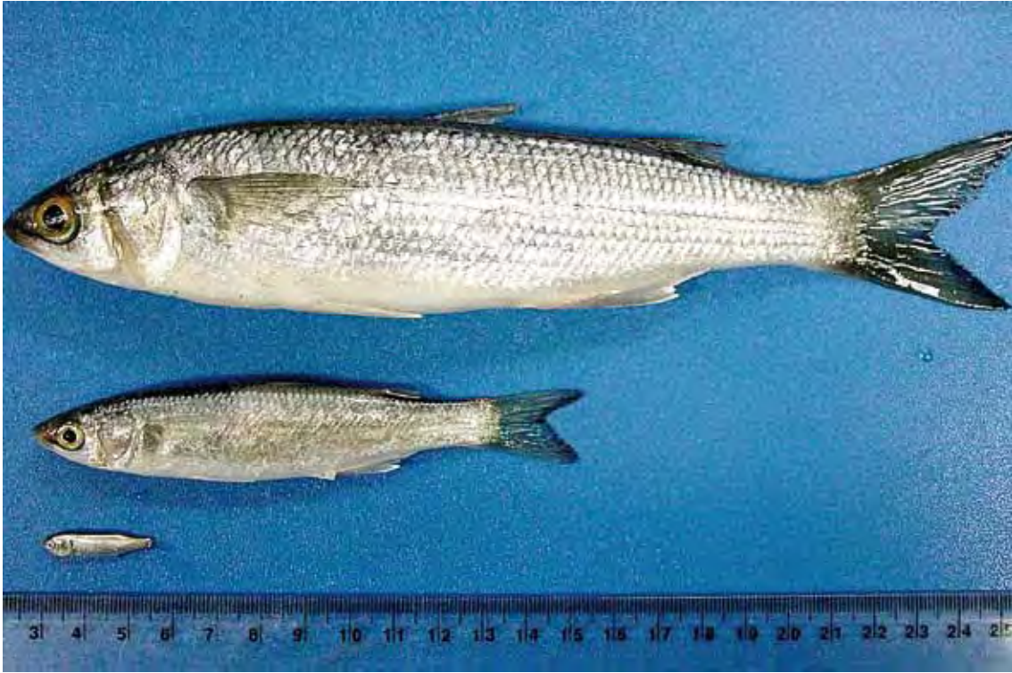
Figure 1 Different stages in the life cycle of Yelloweye Mullet.