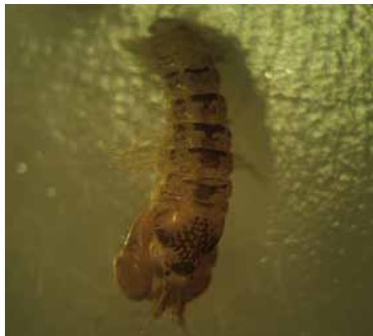
Figure 19 Crustacean or tanaid Tanais dulongii.

fish species, such as the Southern Bluespotted and Yellowtail flatheads ( Platycephalus speculator and P. endrachtensis , respectively), Smalltooth Flounder and Australian Herring ( Arripis georgianus ), and birds such as the Little Black and Little Pied cormorants ( Phalacrocorax melanoleucas and P. sulcirostris , respectively), eat large amounts of carid decapods, while larger Black Bream consume spider crabs. It is likely that carid decapods and/or spider crabs are also important in the diets of other fish species for which there is little dietary information, such as Tailor Pomatomus saltatrix and Mulloway Argyrosomus japonicus .