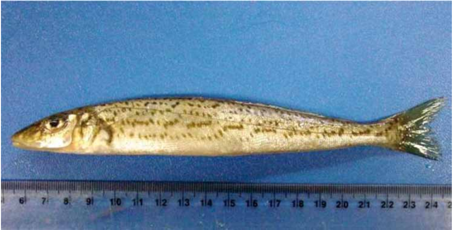
Figure 4 King George Whiting.