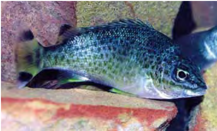
Figure 2 Juvenile Yellowtail Grunter (photograph by D. Morgan, Murdoch University).