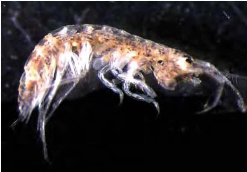
Figure 18 Crustacean or amphipod Grandidierella propodentata (photograph by M. Wildsmith, Murdoch University).