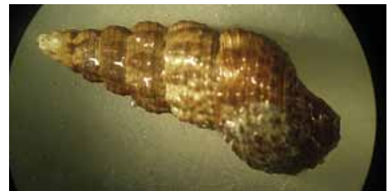
Figure 12 Gastropod Velacumantus australis.

long and muscular siphons of the ‘clams’, which are tubes used for feeding and/or respiration, can be extended into the water above the sediment surface. These structures are often nipped off by fish such as King George Whiting, Trumpeter Whiting and Western Gobbleguts. The Estuary Cobbler Cnidoglanis macrocephalus , which is abundant in Wilson Inlet, is one of the few fish species to ingest large amounts of the thick-shelled T. deltoidalis and V. crenata , but does so only when it has reached lengths in excess of 0.45 m. In contrast, a study of