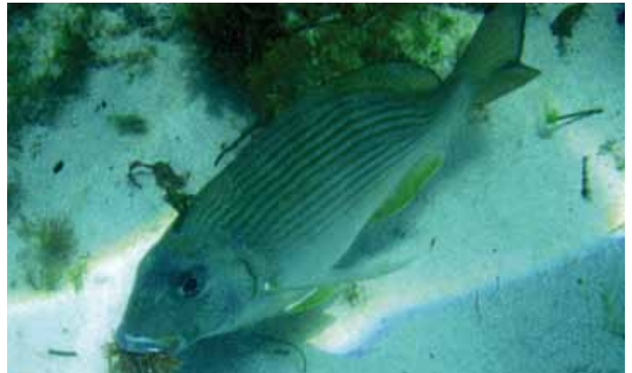
Figure 3 Tarwhine.

Coarse detritus is also sometimes ingested by those fish species that consume benthic or epibenthic prey, such as the Yelloweye Mullet Aldrichetta forsteri (Fig. 1), Yellowtail Grunter Amniataba caudavittata (Fig. 2) and the gobies Favonigobius lateralis and Pseudogobius olorum .