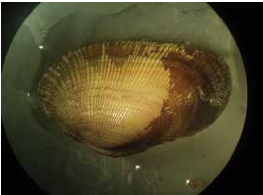
Figure 16 Bivalve or 'clam' Venerupis crenata (photograph by M. Wildsmith, Murdoch University).

the biology of Estuary Cobbler in the Swan–Canning estuary between 1982 and 1984, when this fish species was abundant in that system, showed that the sunset shell was far more important in their diets than either of the two ‘clam’ species, which may reflect its greater ‘palatability’.