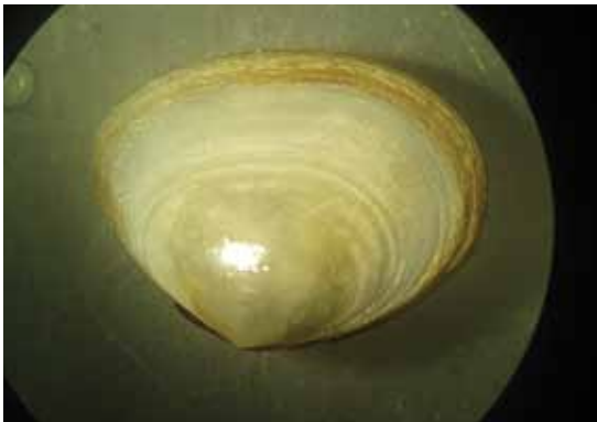
Figure 14 Bivalve or triangle shell Spisula Trigonella (photograph by M. Wildsmith, Murdoch University).