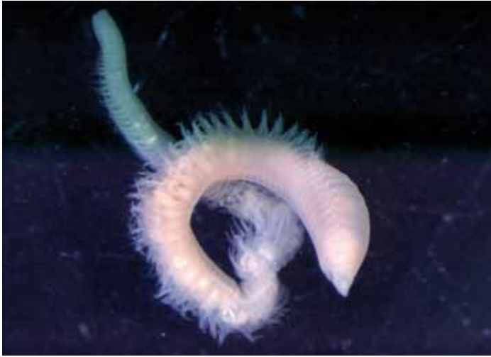
Figure 9 Polychaete Leitoscoloplos normalis . It lives beneath the substrate surface and often among the rhizomes of Widgeon grass (the seagrass Ruppia megacarpa ).