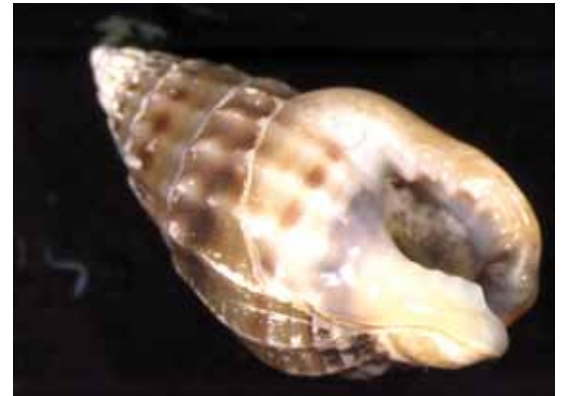
Figure 11 Gastropod or sea snail Nassarius burchardi.

The large bivalves that are common in estuaries of south-western Australia include the sunset shell Sanguinolaria biradiata , the triangle shell Spisula trigonella (Fig. 14), the small mussels Musculista senhousia (Fig. 15) and Xenostrobus spp., and the large and relatively thick-shelled ‘clams’ such as Tellina deltoidalis and Venerupis crenata (Fig. 16). The muscular foot of the sunset shell often protrudes some distance from the edge of their shells, and the