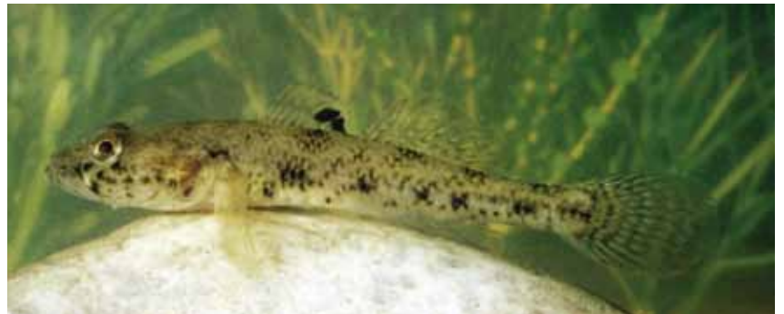
Figure 6 Southwestern Goby.

Tarwhine Rhabdosargus sarba in the lower Swan estuary have been found to feed on increasingly greater amounts of seagrass as they increase in body size (Fig. 3). Recent studies have demonstrated that sparids, such as the Tarwhine, have the digestive enzymes required to break down this plant material and thus the ability to incorporate (assimilate) the released carbon.