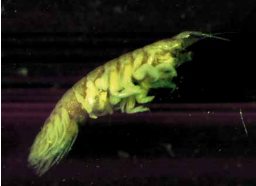
Figure 17 Crustacean or amphipod Corophium minor (photograph by M. Wildsmith, Murdoch University).