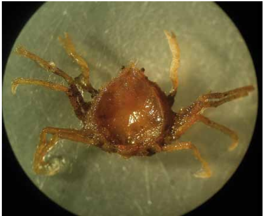
Figure 20 Spider Crab Halicarcinus ovatus.

Black bream, which is highly sought after by recreational fishers in the Swan–Canning estuary, is also abundant in other estuaries in south-western Australia. Its diets have been examined in eight different water bodies along this coast, namely the Moore River estuary, Swan–Canning estuary, Lake Clifton, Nornalup/Walpole Inlet, Wellstead estuary and the Stokes, Broke and Culham inlets. A collation of these studies has demonstrated that Black Bream is a highly opportunistic feeder, with its variable