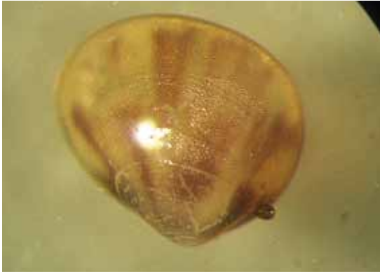
Figure 13 Bivalve Arthritica semen.