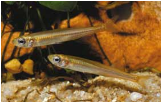
Figure 5 Wallace's Hardyhead.