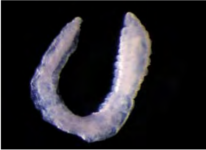
Figure 7 Polychaete Capitella capitata . Their parapodia (feet) are reduced, reflecting the fact that they do not leave the sediment to swim in the surrounding water.