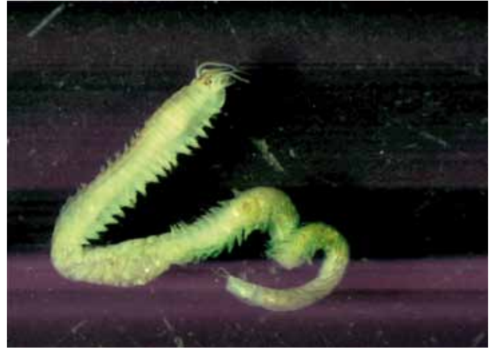
Figure 8 Polychaete Ceratonereis aequisetis. This large polychaete uses the 'hairs' on its paddle-like 'feet' to construct the flexible sandy tubes in which it lives and also for swimming when it enters the water column.

species that do not reach a large maximum size, such as the hardyheads and gobies that are abundant in south-western Australian estuaries (Figs 5 and 6).