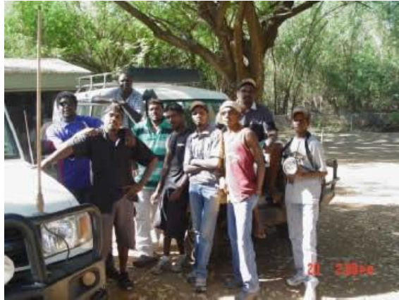
Photo: The Bayulu Rangers in at the Kimberley Toadbusters depot