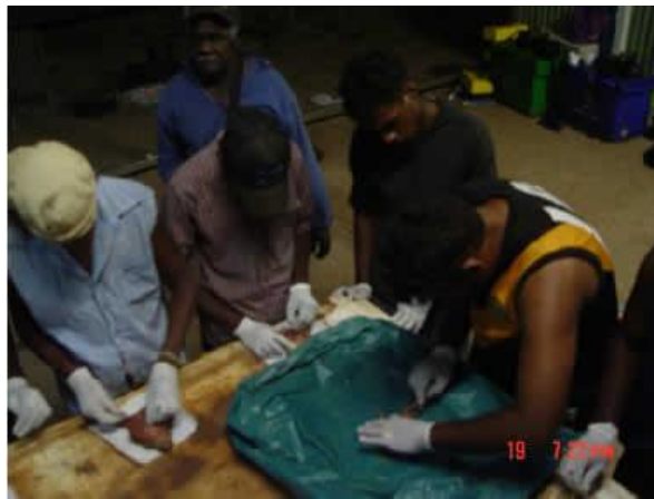
Photo: A random sample of toads were selected for dissection to look at stomach contents, stage of egg development in females and presence of the lung worm parasite. This data is all recoded in the KTB database for research.