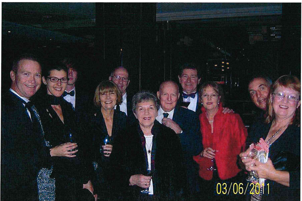
11 KTB volunteers were there to receive the UNNA Community Award.