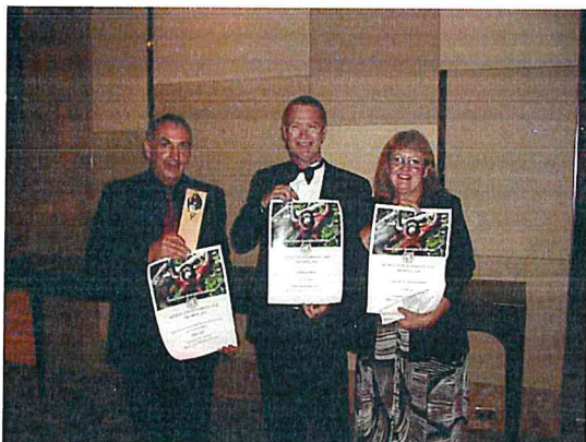
Melbourne.

Kimberley Toad Busters would not be able to operate without all the assistance that it receives from its volunteers and community. It is the community volunteers and voices that make Kimberley Toad Busters and their efforts possible. Without the enormous and committed energy that our wonderful Kimberley community continues to throw towards this feral menace we would not have achieved what we have. KTB are now the proud recipients of 13 major national and international awards ranging from our volunteer work with biodiversity to the highly successful biodiversity educational program. KTB would like to acknowledge that without the support of the state and Liberal governments help we would not have been able to achieve what we have today.