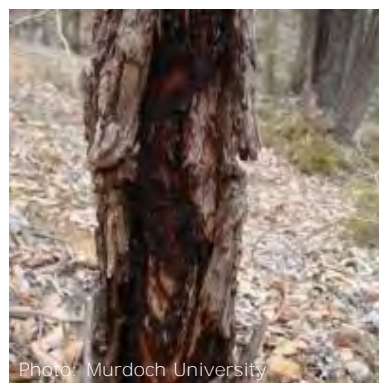
Marri trunk infected with canker disease

Marri ( Corymbia calophylla ) is an iconic Western Australian tree species used by black-cockatoos for feeding, nesting and roosting. In recent decades it has been impacted by a disease known as marri canker, caused by a fungal pathogen which infects the trunks and branches.