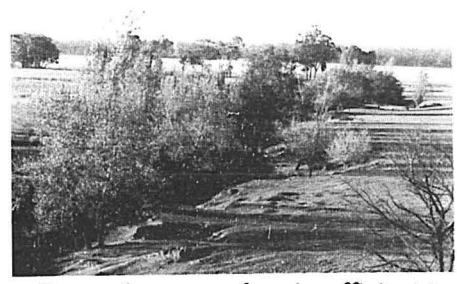
Trees alone are often insufficient to control streambank erosion.

as a physical barrier to surface water and by contributing to soil porosity. Understorey plants are a source of organic material that sustains living organisms in the soil. They also act as a thermal insulator and protect the soil from extremes of