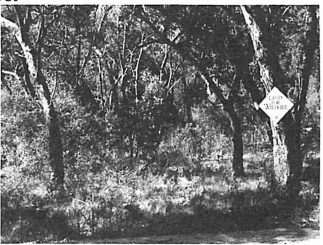
Understorey plants represent some 90% of the plant biodiversity of native vegetation. Their impact on wildlife species is similar in magnitude.

The understorey layer provides habitat predators which can assist in natural pest control. For example, more than ten wasp species parasitise the larvae of leafeating beetles such as Christmas Beetles. The adult wasps feed on nectar and protein from