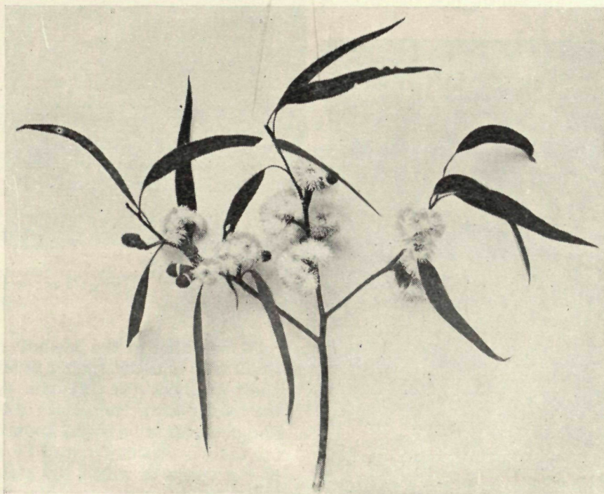
Tuart flowers and leaves. Note operculum being pushed off on lower left-hand spray, prior to opening of the blossom.

tube bell-shaped, the operculum hemispherical to ovoid-hemispherical much broader than the calyx-tube. Stamens with yellowish-white filaments inflected in the bud, the anthers versatile (centrally attached), oblong, opening in longitudinal parallel slits. Fruits stalkless, bell-shaped, smooth or with one faint rib, three-quarters of an inch long, the disc slightly raised, narrow, the capsule deeply included in the fruiting calyx-tube with broad triangular truncate valves almost level with the orifice of the fruit.