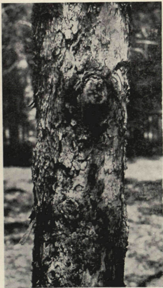
Close-up of the trunk of the Illyarrie, showing white bark partly covered by patches of older bark.

The species remained in obscurity, however, until in recent years it was found in some abundance at Bookara Siding not far from Dongara. Today it is found in many parks and gardens both in the city and in the country, and it is successfully cultivated abroad.