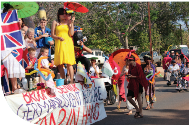
Broome cadets at a community fair.

This year saw a delay in the use of the DEC website, due to a corruption of the site which caused its collapse and the need for a new site to be developed. This has taken the majority of the year and has caused some setbacks in supporting units and their ability to network through this electronic media format. The new site should be active in 2012.