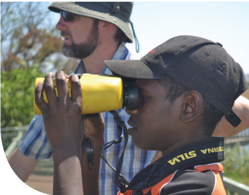
A Wyndham cadet birdwatching.

It was a big year for Kimberley Bush Rangers, with the number of units in the region more than doubling. In semester one we welcomed the Derby unit into the fold, and they got straight into it, entering the Gibb River Road Mountain Bike Challenge with their counterparts from Kununurra and Fitzroy Valley. In June, they held their inaugural Kimberley Bush Rangers conference in Fitzroy Crossing, where instructors were joined by DEC staff and representatives of environmental groups from across the region. Wyndham and Broome units came on board in term three, with Wyndham joining Bush Rangers units from Kununurra and Derby for a bushcraft and survival camp. A highlight for six cadets from Kununurra was a week-long work experience program with DEC, with another cadet currently undertaking a school-based traineeship. The Bush Rangers program will continue to grow in the Kimberley in 2012, with the passion and dedication from cadets and instructors alike ensuring a lot more exciting activities and projects.