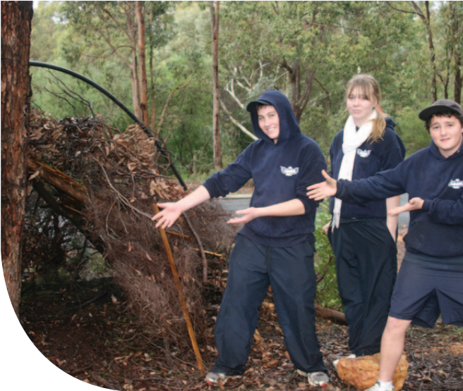
Mundaring cadets building shelters.