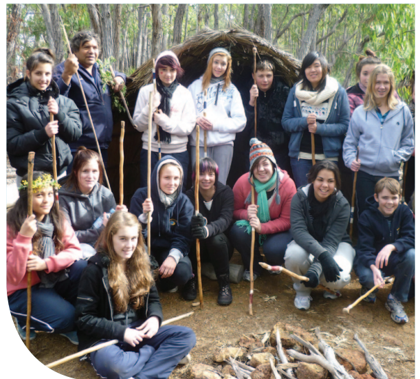
Left: Ellenbrook cadets. Right: Mandurah cadets.