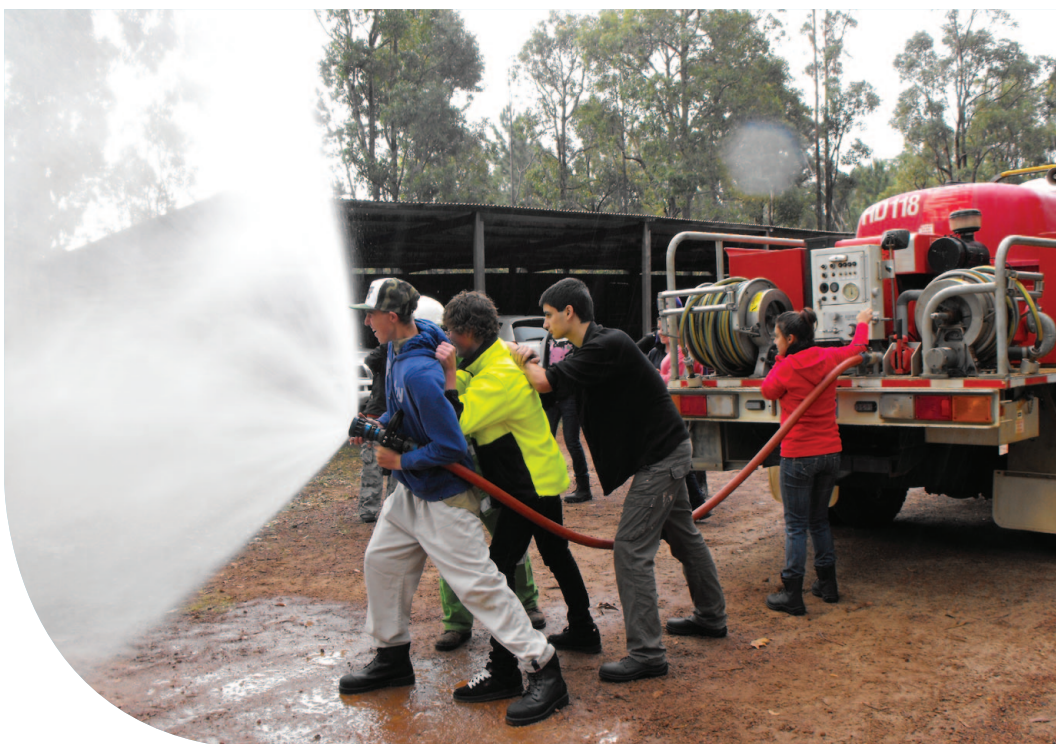
Emmanuel and Albany cadets managing the high pressure hose.

This year fourteen cadets took part in the reward experience from three different cadet units—Albany Secondary Education Support Centre, Emmanuel Catholic College and Mercy College—with a total of four instructors in support. Despite the unfortunate weather, great fun and enjoyment was had by all!