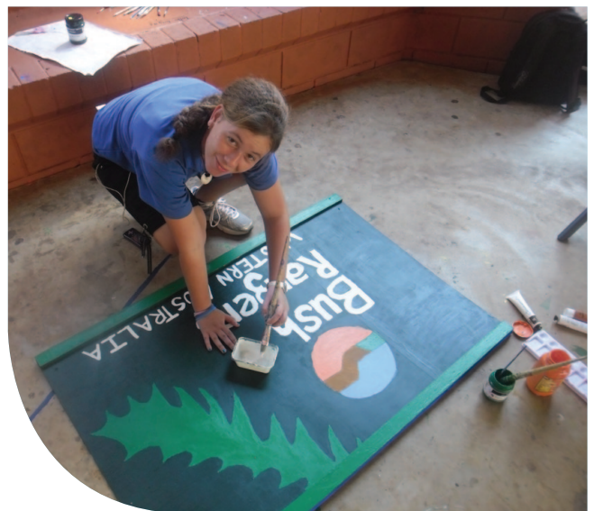
Left: Emmanuel cadets getting to grips with worms and composting. Right: A Broome cadet making a sign board.