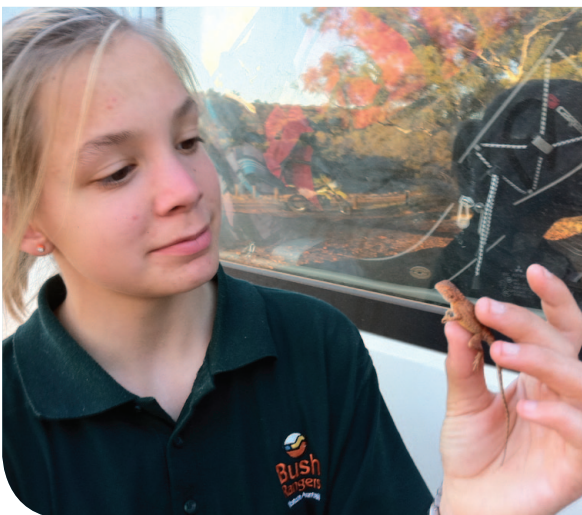
A Northam cadet learning about the world around her.

In addition, the program attracts many informal partnerships that support Bush Ranger units by offering excursion opportunities and professional development training that address the key objectives of the program. In 2011, the units were supported by more than 123 organisations across the state. This does not take into account the variety of support offered from within DEC or individual people who gave their time.