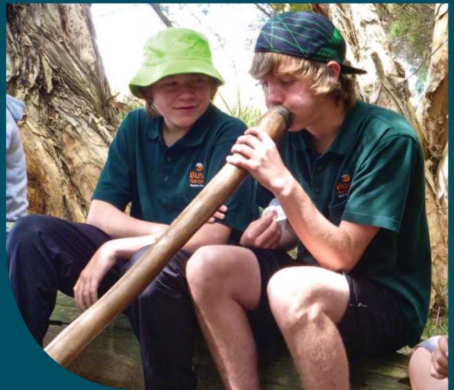
Top left: Mercy cadet getting up close and personal with raptors. Top right: Canning Vale cadets on a sensory trail. Bottom left: Esperance cadets. Bottom right: Carmel cadets learning about Indigenous culture.