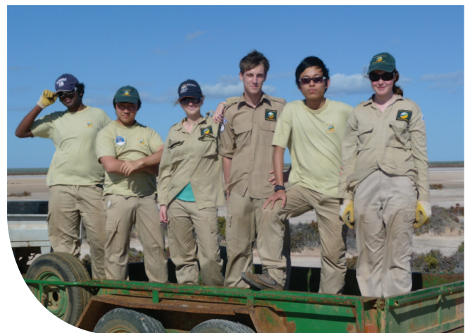
Rossmoyne cadets at Shark Bay.