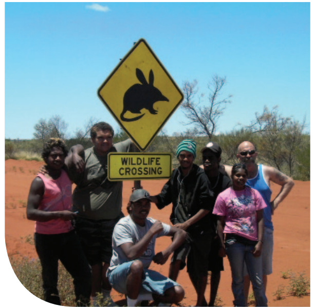
Left: Thornlie cadet abseiling. Right: Wongutha CAPS cadets.

In 2011, Duncraig cadets planted 3,000 salt bushes, shrubs and trees in salt-affected paddocks and 100 bird boxes were constructed and installed in homes and bushland.