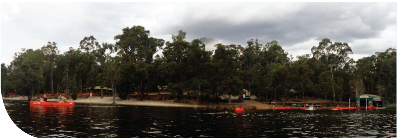
Mundaring cadets having a paddle.

Clontarf cadets were involved in conservation activities with Yanchep National Park rangers in 2011, pulling out over 1,000 turnip weeds near the park entrance and weeding around the native flower garden.