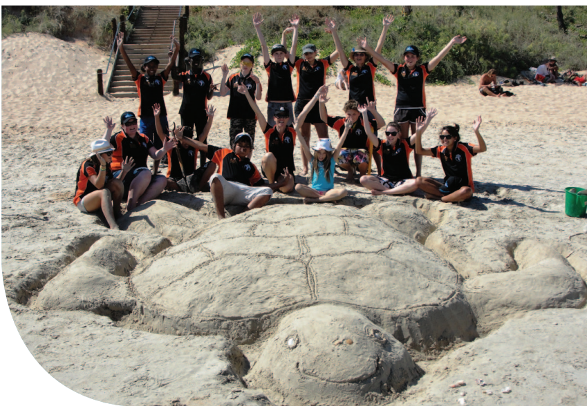
Derby cadets celebrating World Turtle Day.

“There is no doubt that the program has raised the profile of conservation and caring for the environment. We have found that there has been a significant increase in students wanting to undertake work placements in the areas related to Bush Rangers.”