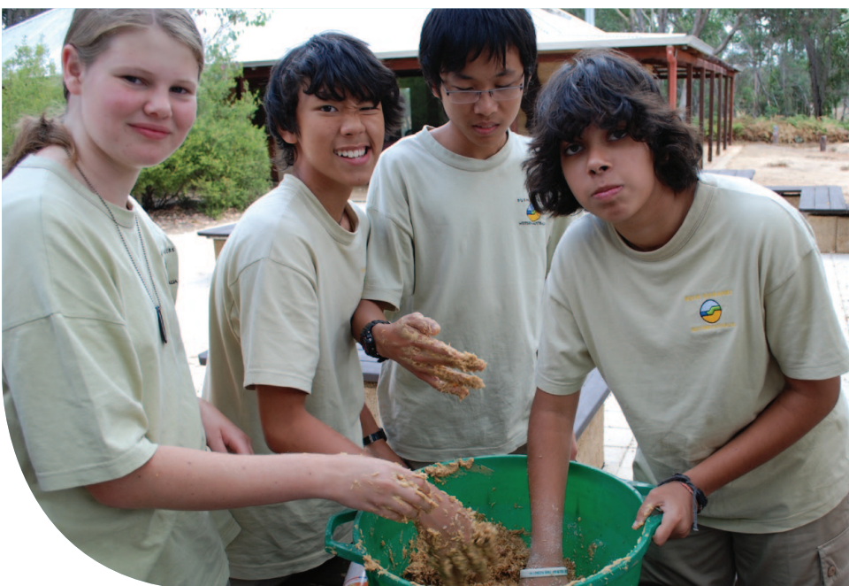
Kalbarri cadets preparing bait.

Based at Perup Nature Reserve, east of Manjimup, the cadets work with technical officers from DEC's Science Division to learn about monitoring wildlife through fauna trapping, spotlight surveys and mapping vegetation. In addition to the skills learned at each of the reward camps, this experience assists cadets to achieve outcomes in Module 5 (The Meaning of Conservation) and Module 8 (Winning Back Wildlife).