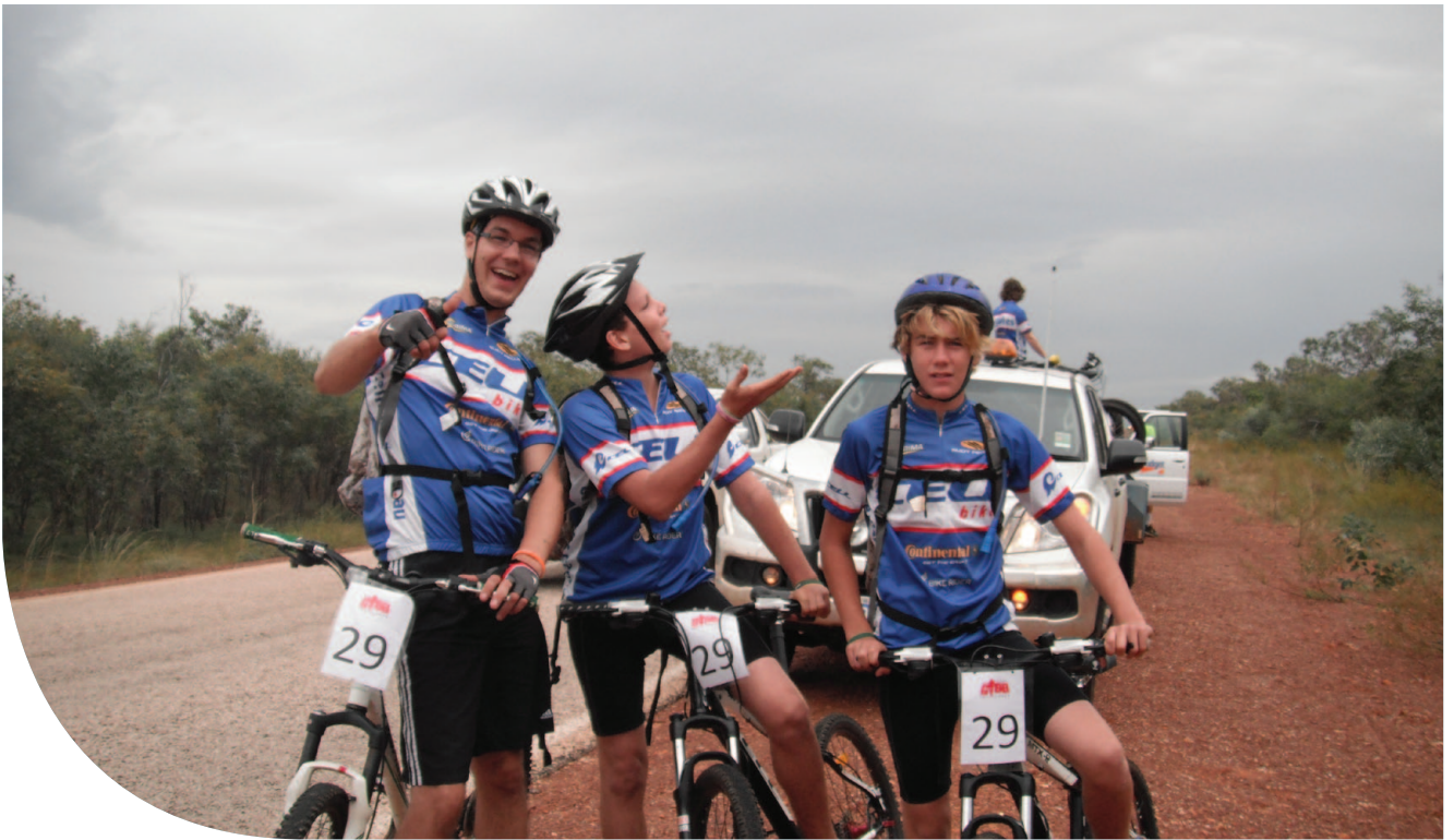
Kununurra cadets cycling the Gibb River Road Mountain Bike Challenge.