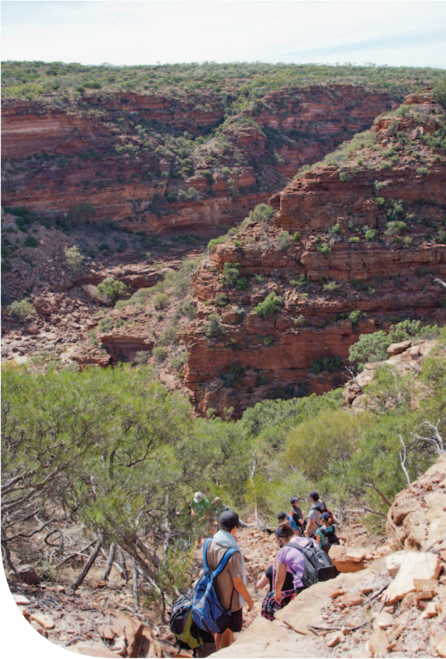
Emmanuel cadets out on a hike.