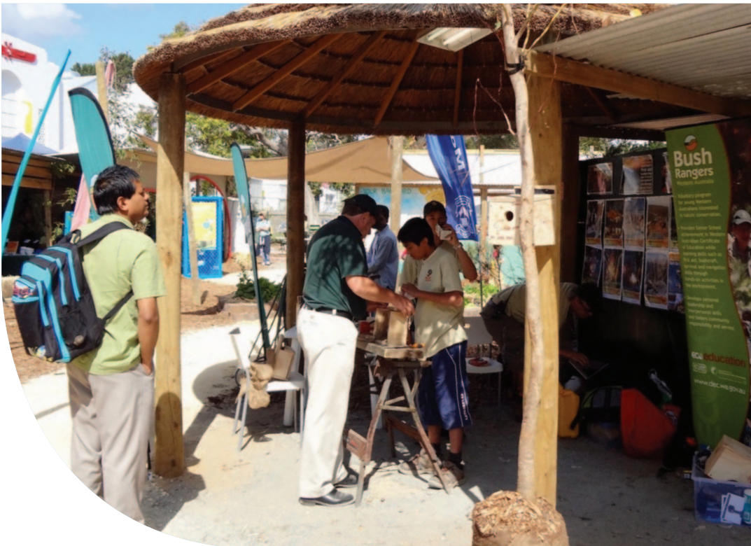
The Bush Rangers' stand at the Perth Royal Show.