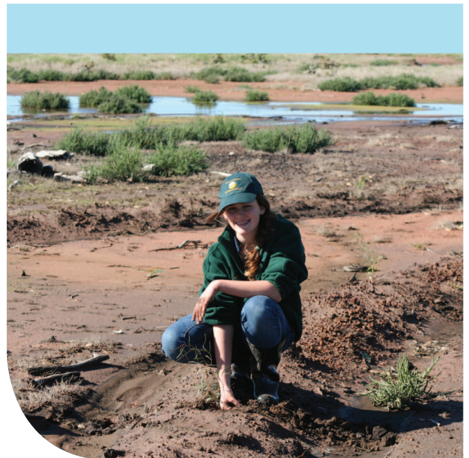
Left: Emmanuel cadets planting. Right: Duncraig cadet.