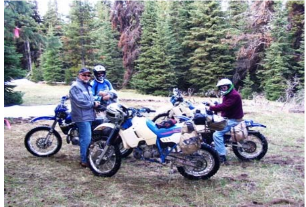
Trail bike riders in the Swan Coastal District

Vehicles. It is hoped that this study will ultimately provide clarity regarding where ORV activity could be permitted, appropriate facilities developed, and where it is not permitted. The project aligns with the Trails Planning recommendations of the State Trail Bike Strategy.