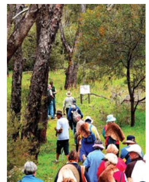
Visitors enjoying our national and regional parks.