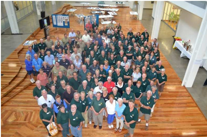
Happy Campers at the 2011 Campground host workshop in Kensington

If you would like to book a place please visit www.dec.wa.gov.au and click on Community and education > Volunteer programs > Campground hosting - you'll be able to find a full training calendar and booking forms.