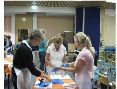
Volunteers at the Advanced necropsy in birds course in 2011

A major piece of work currently being undertaken is the review of the " Minimum Standards for Wildlife Rehabilitation " by DEC and members of the Wildlife Rehabilitators Consultation Group. This group is made up of various representatives from wildlife rehabilitation groups, Perth Zoo vets and DEC Nature Protection officers.