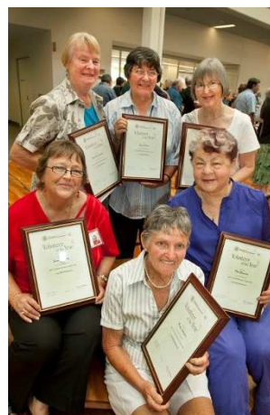
Volunteers of the Year, the WA Herbarium Specimen Mounting team

Each person involved in volunteering at DEC is providing an outstanding service to nature conservation in WA – many projects would simply not be possible without volunteers—Jim Sharp