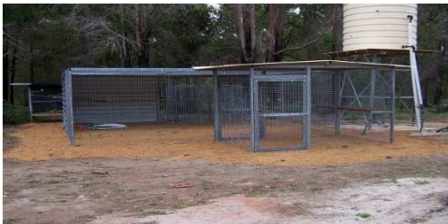
Left: The new Black Cockatoo enclosure