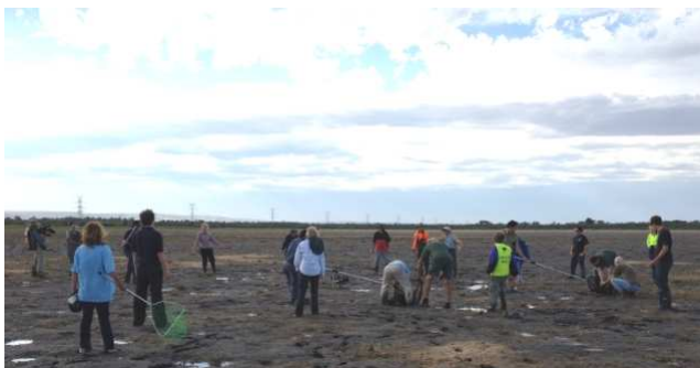
Volunteers on the mud at Forrestdale Lake

The Nature Protection Branch and CIU would like to express their sincere appreciation and thanks for the efforts of the volunteers that attended the rescue at such short notice.