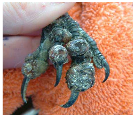
Magpie foot with pox lesions

It is possible to treat the lesions on affected birds, however it is always advisable to seek the advice of a vet before giving any treatment.