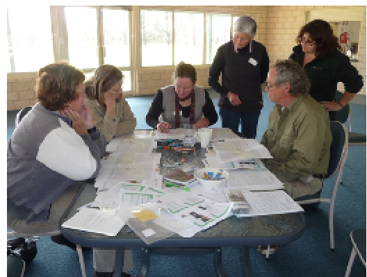
Volunteer training in the Shire of Woodanilling - checking maps to work out where to survey

Where: In various locations around the state from the northern agricultural region to the south west, wheatbelt and southern regions.