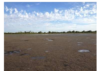
The dry Forrestdale Lake

Perth zoo vets were on hand to check the condition of the birds before they were handed to rehabilitators to care for further care. The cap-