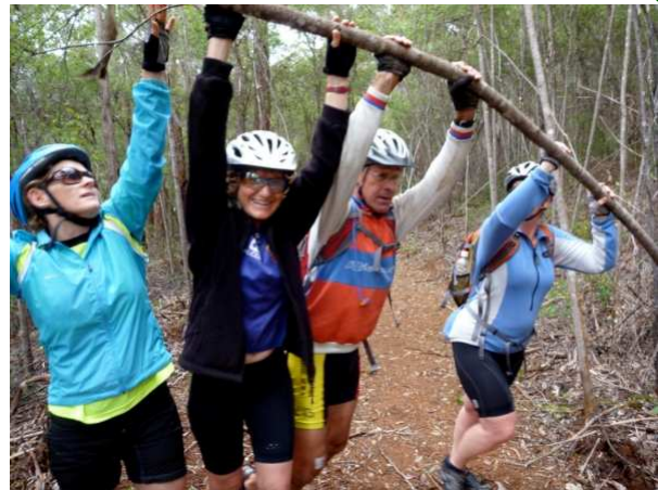
Volunteers conducting trail maintenance while on a ride on a new section of the Trail

Using skills and tools provided in the workshop, volunteers assist DEC with issues such as signage, overgrowth, rubbish, erosion and obstacles on the Trail.