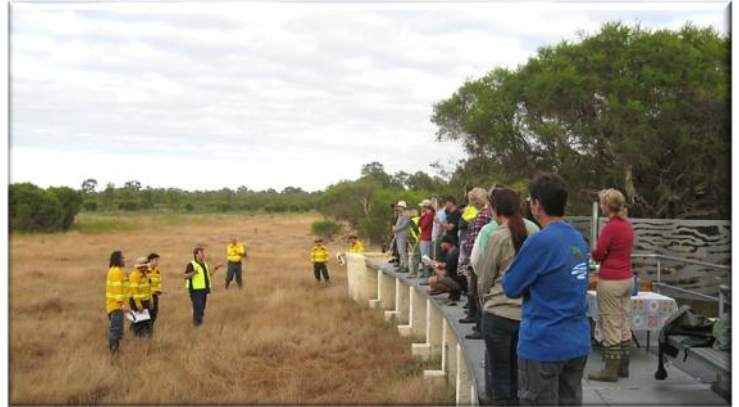
Briefing volunteers before setting off

36 volunteers from the local community and wildlife centres and staff from the City of Armadale plus 11 DPaW staff answered the call.