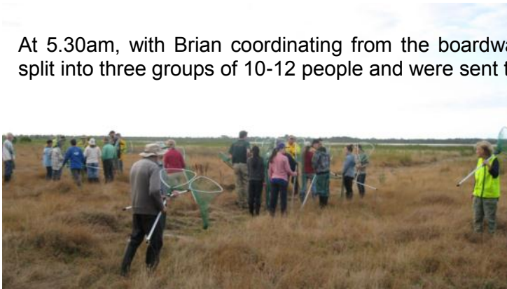
Setting off across the lake

At 5.30am, with Brian coordinating from the boardwalk and communicating via radio, the volunteers were split into three groups of 10-12 people and were sent to various parts of the lake.