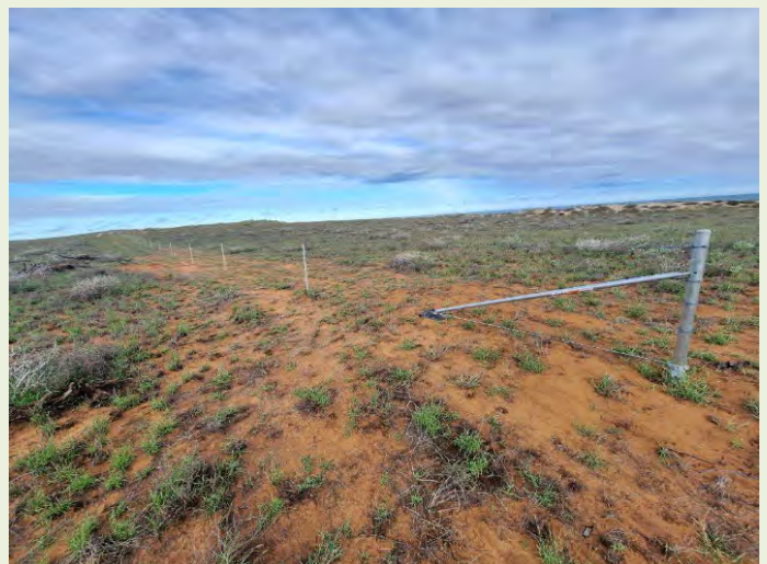
Right: 6.3kilomter stock exclusion fence.

The fence aims to protect natural and cultural values of the reserve by mitigating the impacts from stock animals.