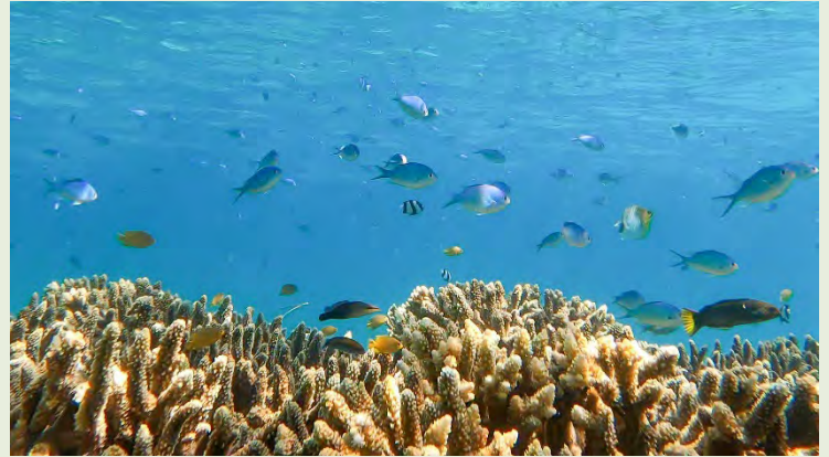
Above: Marine life is abundant.