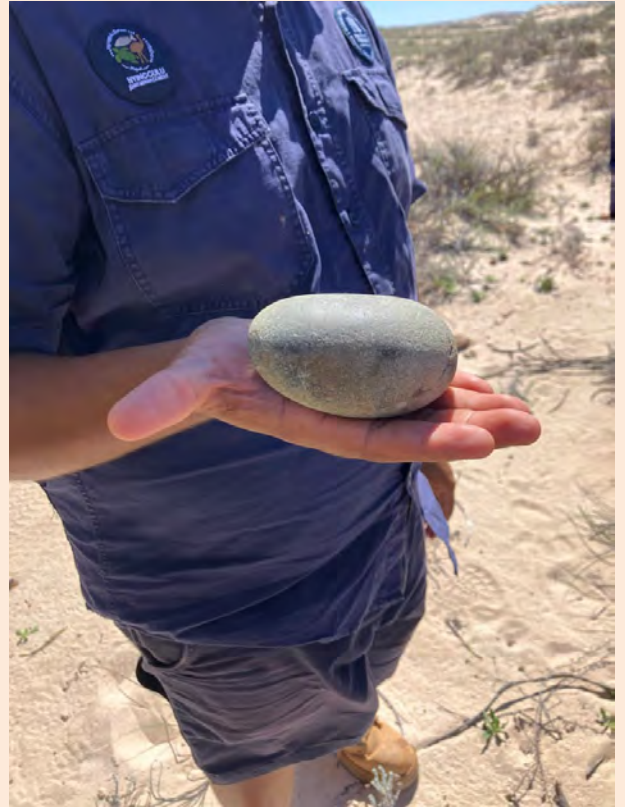
Above: Baiyungu Ranger holding a grinding stone.

The Traditional Owners and archaeological consultants will share their reports of the findings and the Nynggulu Joint Management Body to work together to preserve and protect cultural values of this area into the future.