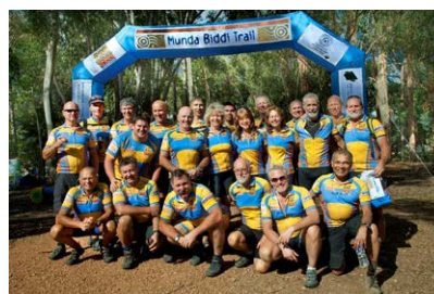
The Munda Biddi Trail Blazers.