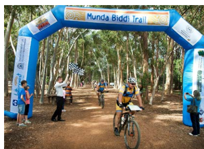
Munda Biddi Trail Blazers are flagged in at Mundaring by Minister Jacob.