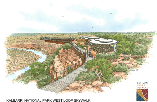
KALBARRI NATIONAL PARK WEST LOOP SKYWALK

Kalbarri National Park is one of WA's tourism icons providing a stunning setting for tourists to enjoy a wide range of activities. The proposed kiosk is part of a larger Royalties for Regions funded project that aims to reinvigorate local and regional tourism.